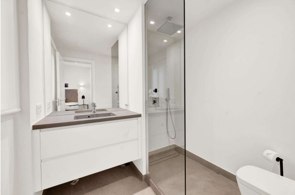
Bathroom in a modern garden apartment for sale