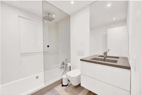
Bathroom in a ground floor apartment for sale