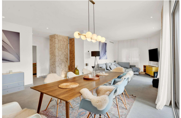
Dining area in Portals