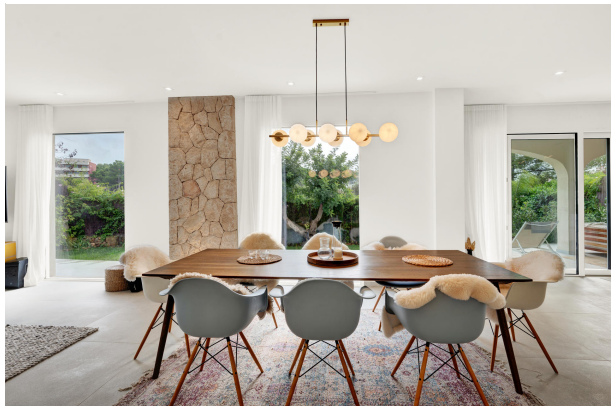
Dining room in Portals garden apartment