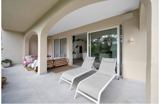
Garden apartment for sale in Portals