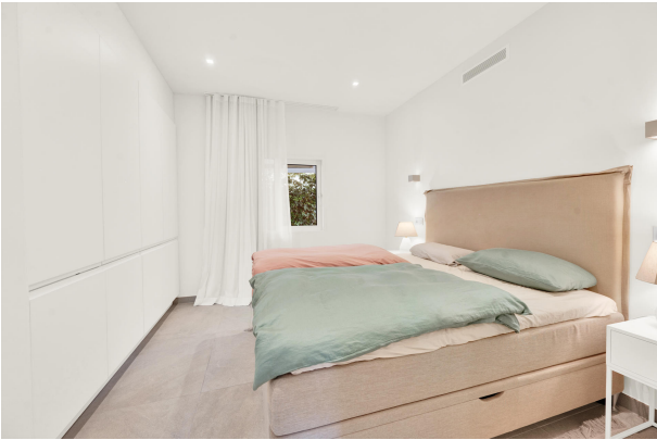
Bedroom in apartment for sale KPO01659