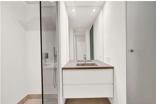
Bathroom in a modern apartment for sale