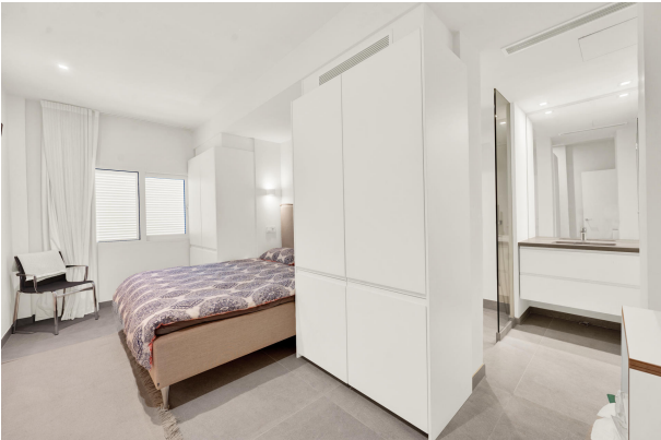
Bedroom in apartment for sale