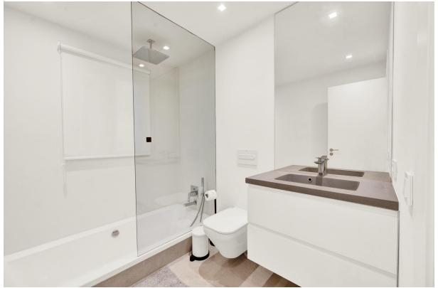
Bathroom in a ground floor apartment for sale