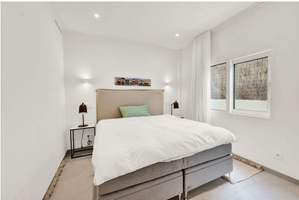
Bedroom in Portals