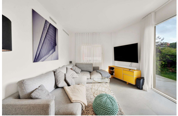
Living room in apartment for sale in Portals