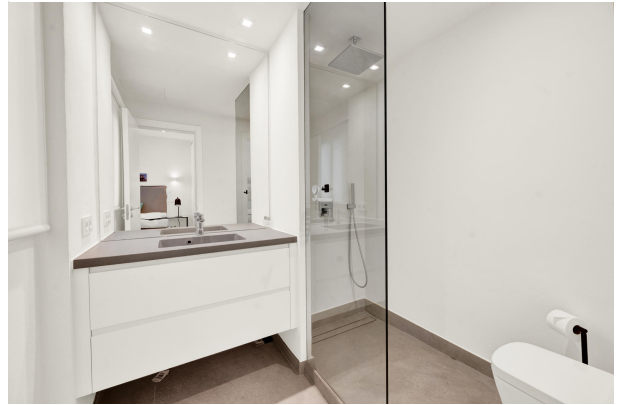
Bathroom in a modern garden apartment for sale