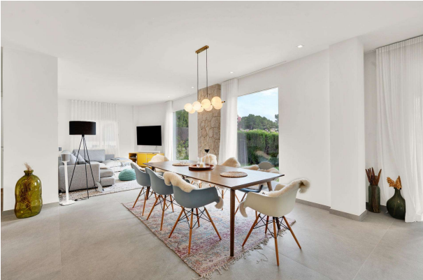
Garden apartment for sale