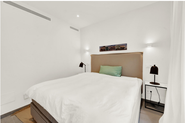
Bedroom in garden apartment for sale