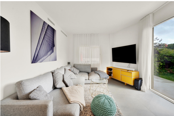
Living room in apartment for sale in Portals