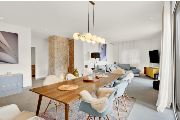
Dining area in Portals