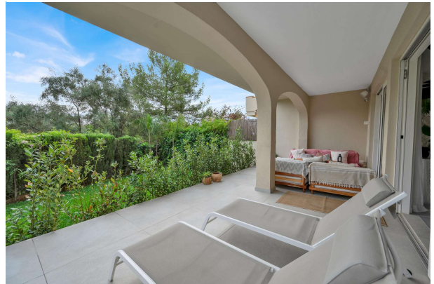
Terrace in Portals garden apartment