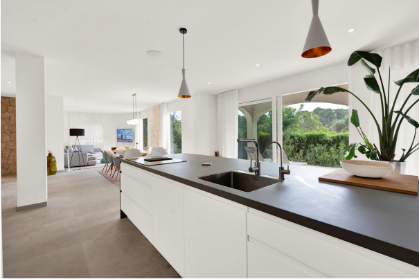
Modern kitchen in Portals