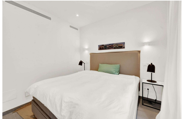
Bedroom in garden apartment for sale