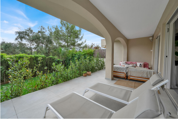
Terrace in Portals garden apartment