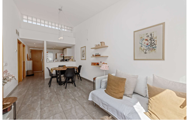
WhatsApp Image 2025-07-18 at 13.47.34