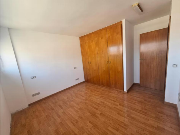
Captura de pantalla 2024-08-29 140238