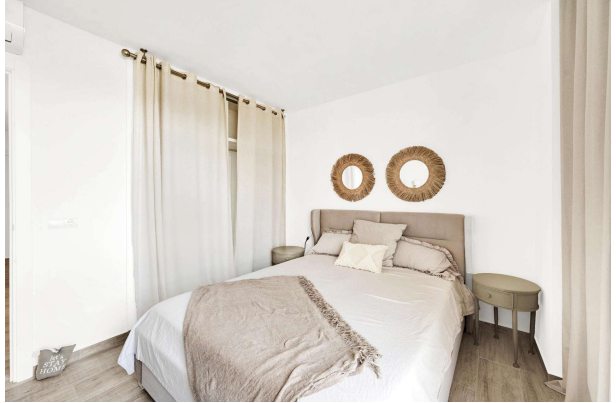
Bedroom in Palmanova