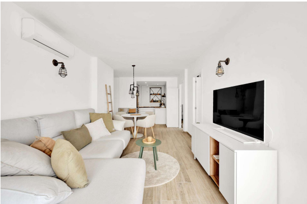
Living room in Palmanova KPO01717