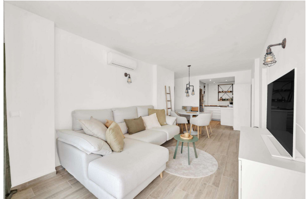
Apartment for sale