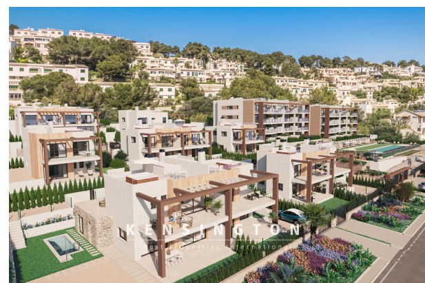
Apartments + villas