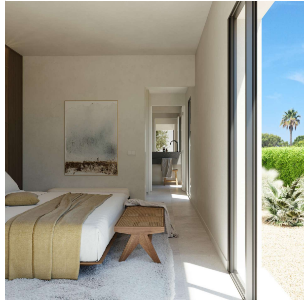
Bildschirmfoto 2025-08-05 um 13.07.23