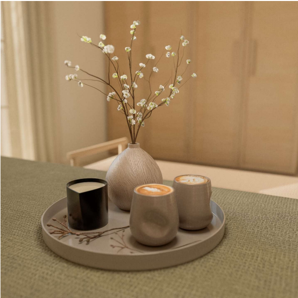
WhatsApp Image 2025-07-24 at 12.56.35 (1)