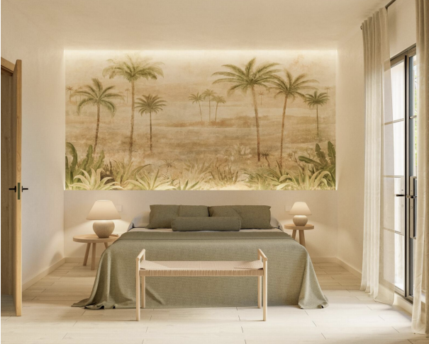
WhatsApp Image 2025-07-24 at 12.56.34