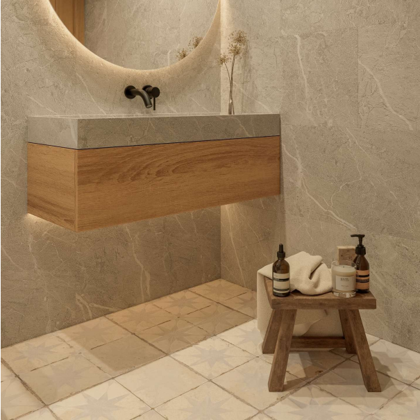
Bildschirmfoto 2025-07-25 um 13.58.45