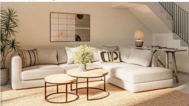
Bildschirmfoto 2025-07-25 um 13.58.25