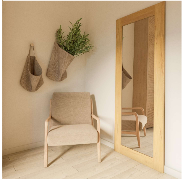
WhatsApp Image 2025-07-24 at 12.56.35 (4)