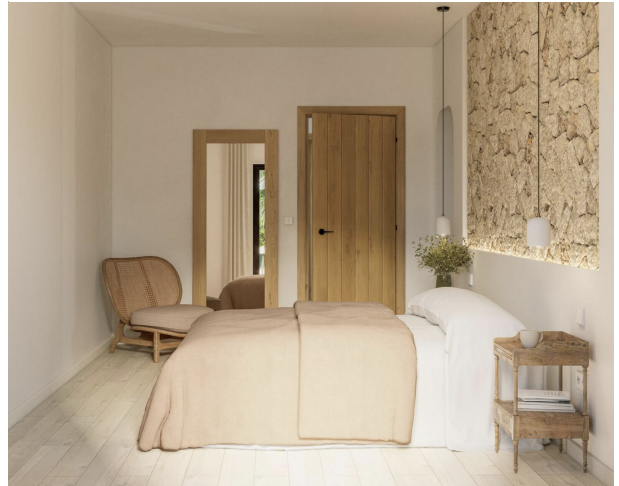
WhatsApp Image 2025-07-24 at 12.56.35 (5)