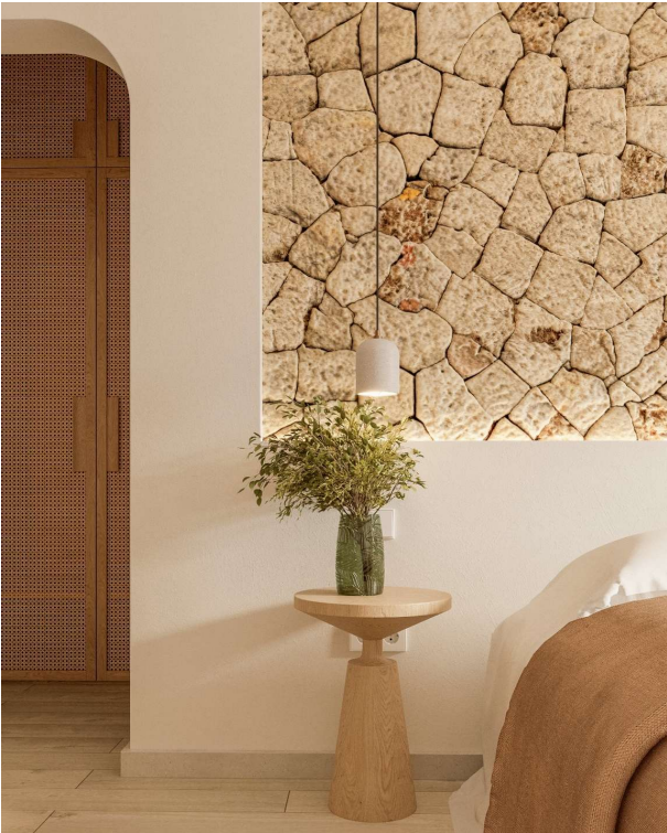
WhatsApp Image 2025-07-24 at 12.56.35 (6)