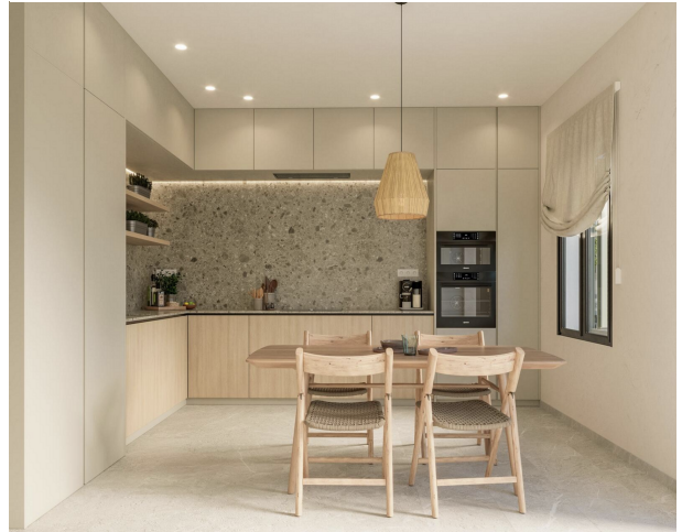
WhatsApp Image 2025-07-24 at 12.56.36