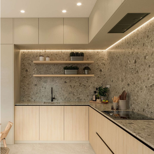
Bildschirmfoto 2025-07-25 um 13.58.34