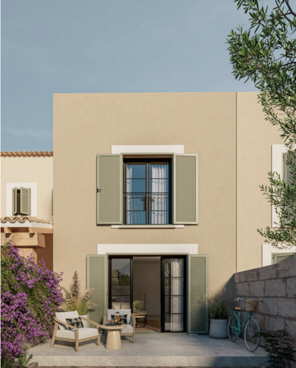
WhatsApp Image 2025-07-24 at 12.56.34 (2)