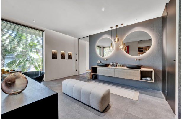
Modern and big bedroom