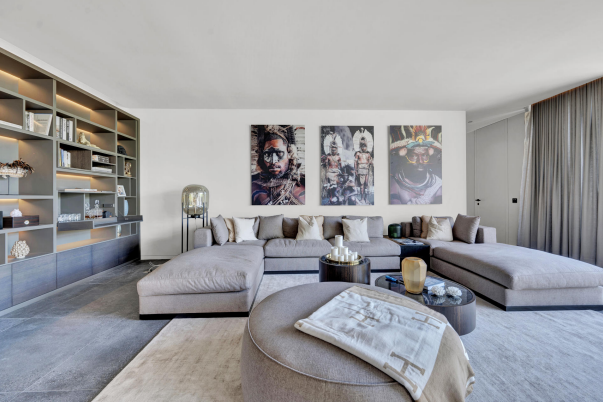
Living room with light flooded