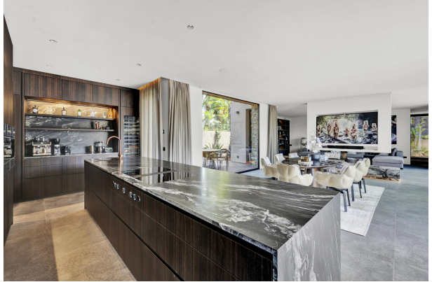
Modern and open kitchen