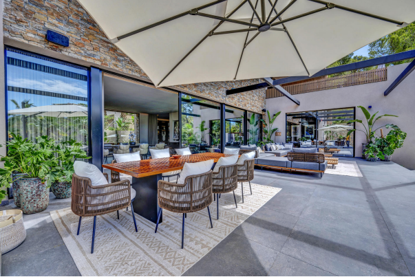
Terrace area with pool