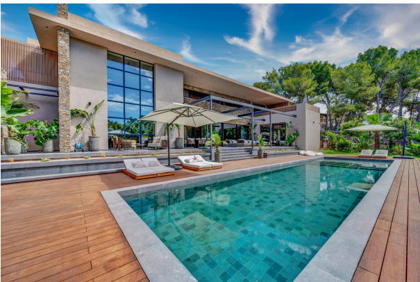
Terrace with beautiful pool area