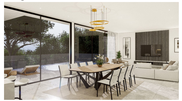
Dining area in Costa den Blanes