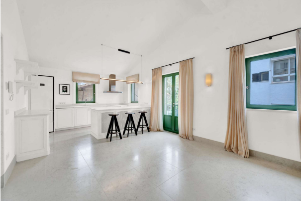
Open kitchen Cas Catala