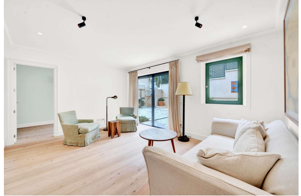
Second living room