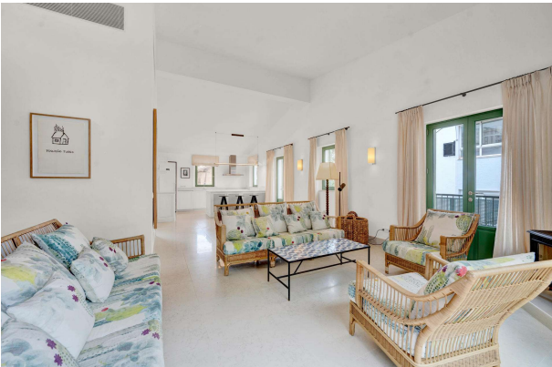
House for sale KPO01719 Cas Catala