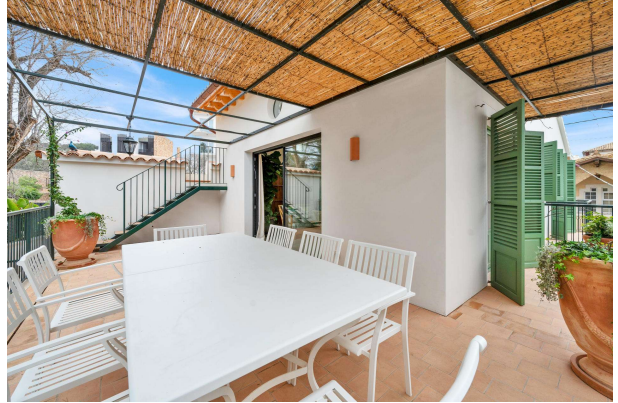
Terrace in Cas Catala