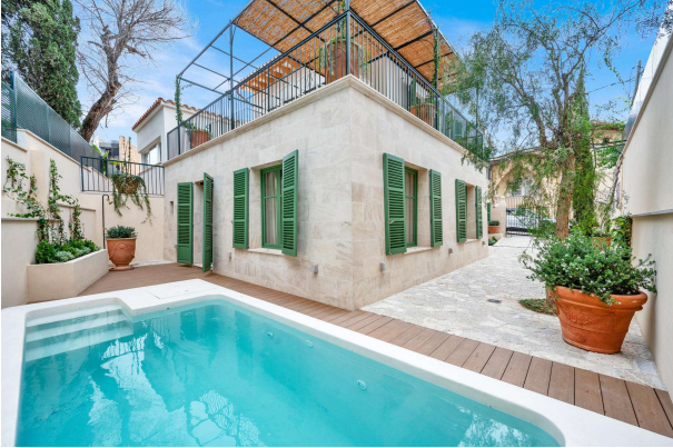
House for sale KPO01719