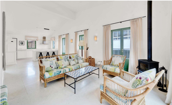
Living room in a house for sale in Cas Catala KPO01719