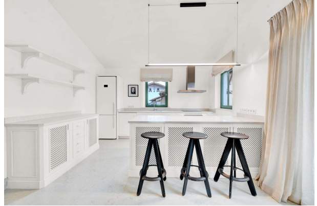
Kitchen in Cas Catala KPO01719