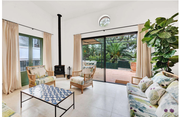
Main living room