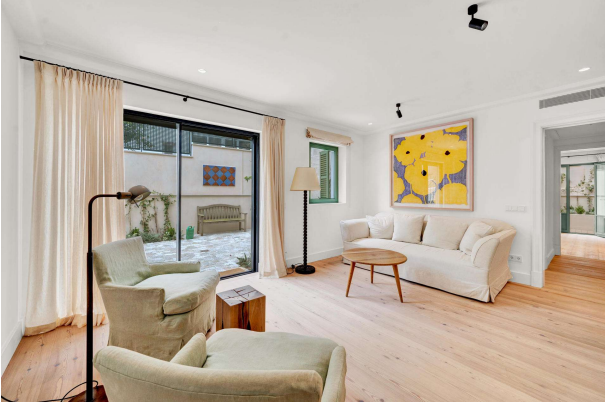
Living room KPO01719 Cas Catala