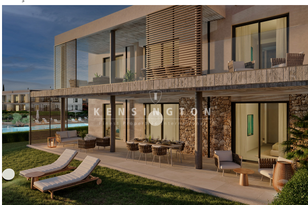
Porch (ground floor)