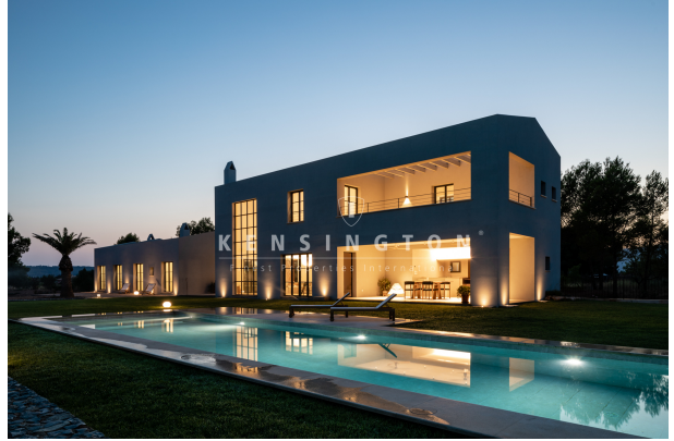
Porch covered pool terrace