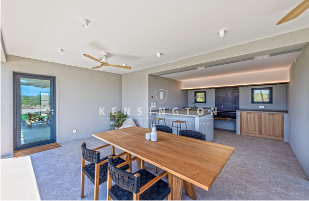
Porch covered pool terrasse