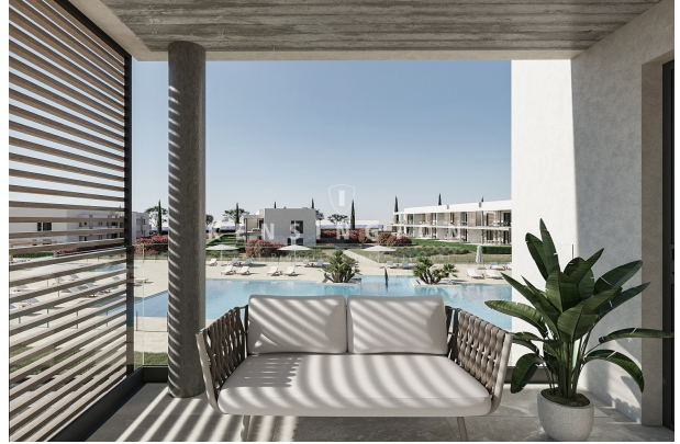
Complex and pool