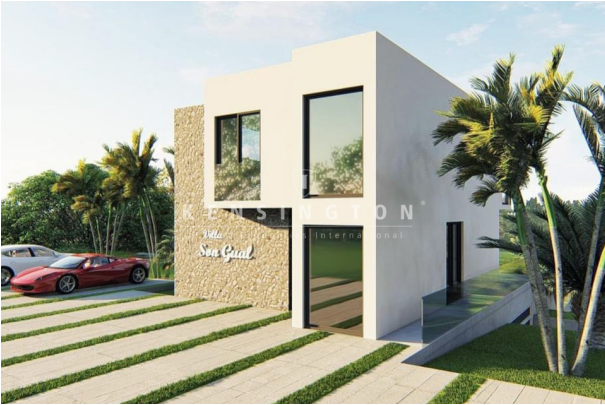
Plot & façades