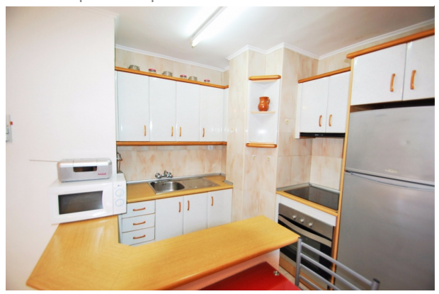
living room and kitchen apartment portals nous