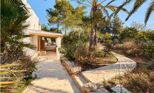
2KPI1310 - Villa en venta - Villa zu verkaufen - Villa for sale - Villa te koop