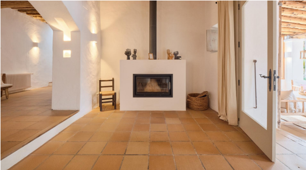
2KPI1310 - Villa en venta - Villa zu verkaufen - Villa for sale - Villa te koop - www.kensington-ibiza.com - Noelle Politiek