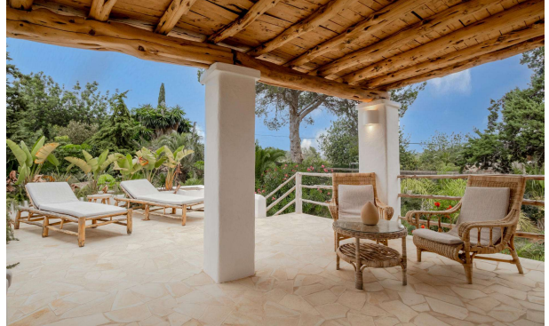
KPI1310 - Villa en venta - Villa zu verkaufen - Villa for sale - Villa te koop -