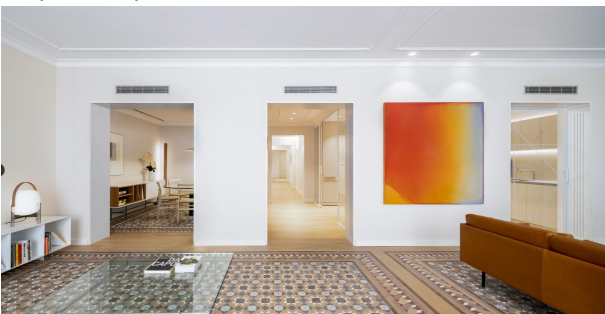
Captura de pantalla 2024-06-20 113026