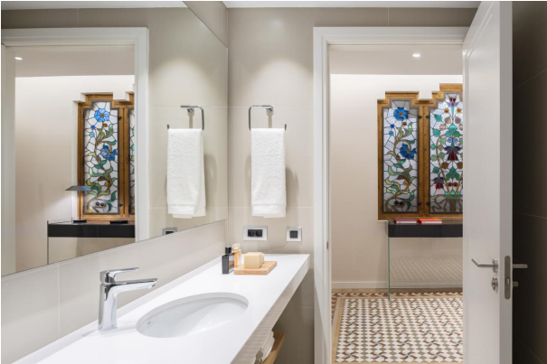
Captura de pantalla 2024-06-20 112948