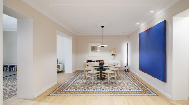
Captura de pantalla 2024-06-20 112736