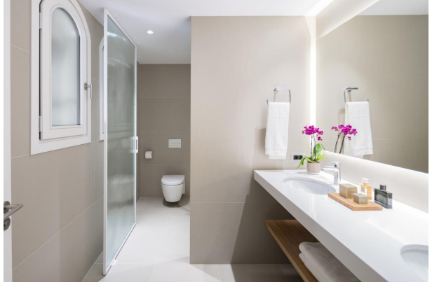
Captura de pantalla 2024-06-20 112838