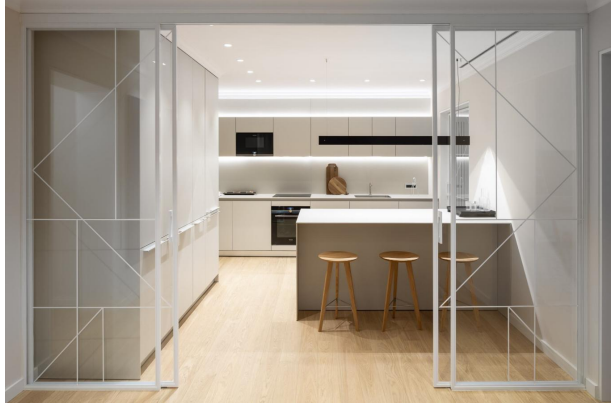
Captura de pantalla 2024-06-20 113326