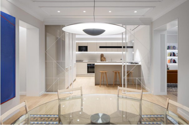
Captura de pantalla 2024-06-20 113250