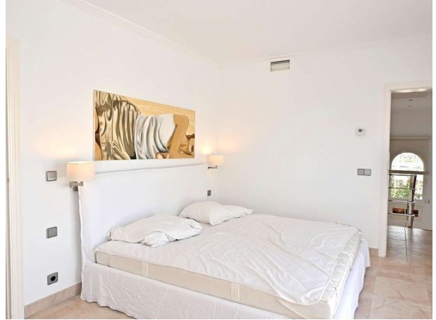
WhatsApp Image 2025-06-18 at 19.19.25