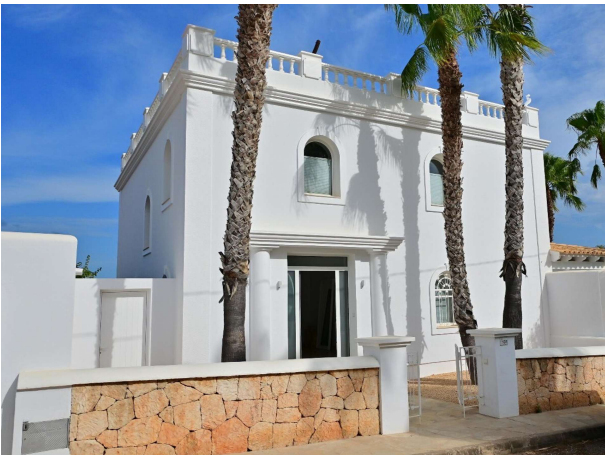
WhatsApp Image 2025-06-18 at 19.19.00 (1)