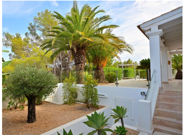
WhatsApp Image 2025-06-18 at 19.19.07 (2)