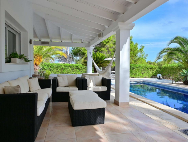
WhatsApp Image 2025-06-18 at 19.19.25 (1)