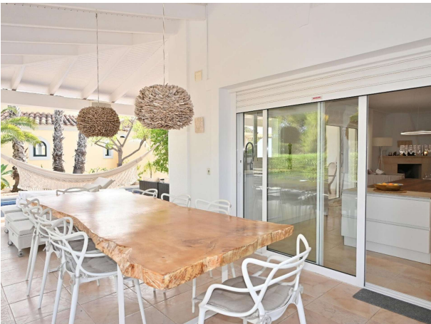
WhatsApp Image 2025-06-18 at 19.19.09 (1)