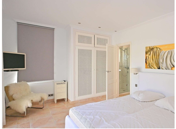
WhatsApp Image 2025-06-18 at 19.19.20 (2)