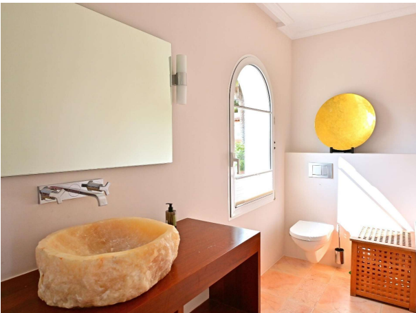
WhatsApp Image 2025-06-18 at 19.19.08