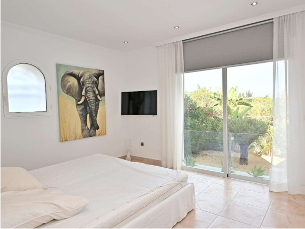
WhatsApp Image 2025-06-18 at 19.19.00