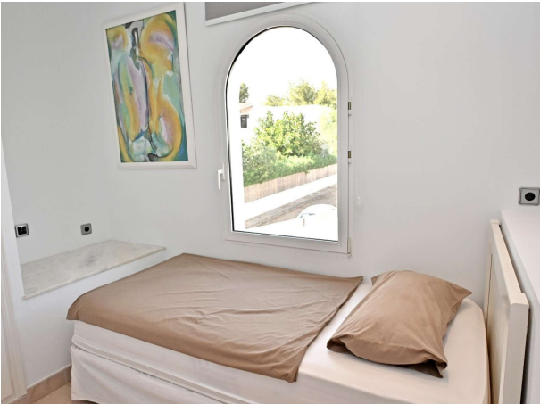
WhatsApp Image 2025-06-18 at 19.18.58 (2)