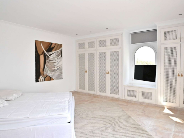
WhatsApp Image 2025-06-18 at 19.19.07