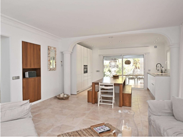
WhatsApp Image 2025-06-18 at 19.19.20 (1)