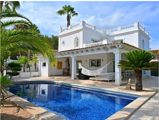
WhatsApp Image 2025-06-18 at 19.19.15