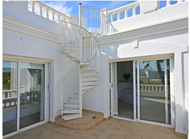
WhatsApp Image 2025-06-18 at 19.19.08 (1)