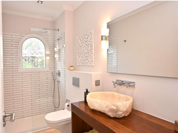
WhatsApp Image 2025-06-18 at 19.19.25 (2)