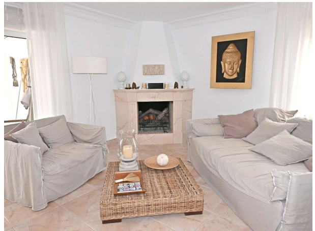
WhatsApp Image 2025-06-18 at 19.19.09