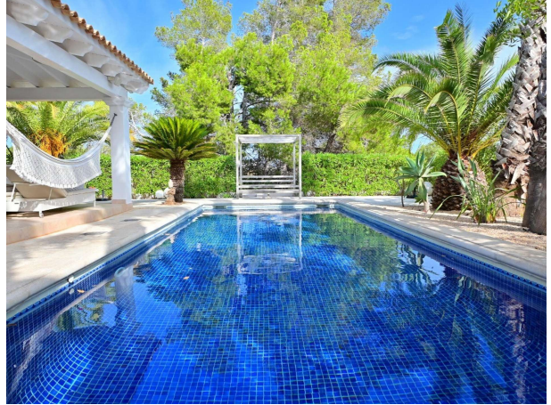
WhatsApp Image 2025-06-18 at 19.19.13