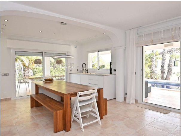
WhatsApp Image 2025-06-18 at 19.19.23