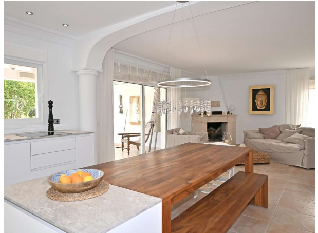
WhatsApp Image 2025-06-18 at 19.19.20