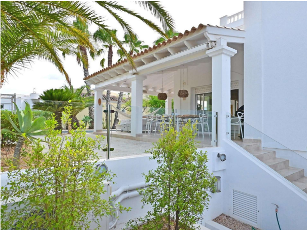
WhatsApp Image 2025-06-18 at 19.19.07 (1)