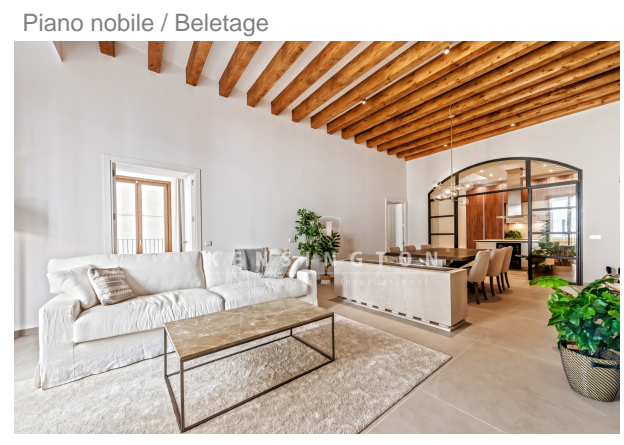
Piano nobile / Beletage