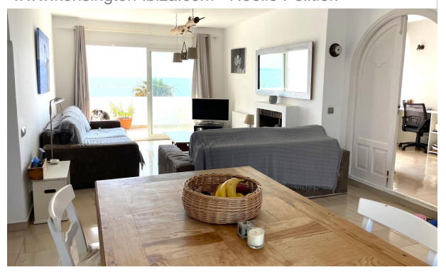
KPI1360 - Ático en venta - Penthouse zu verkaufen -Penthouse for sale - Penthouse te koop www.kensington-ibiza.com - Noelle Politiek