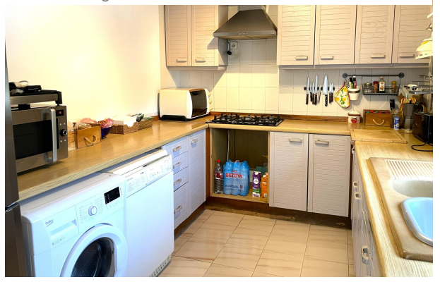
KPI1360 - Ático en venta - Penthouse zu verkaufen -Penthouse for sale - Penthouse te koop www.kensington-ibiza.com - Noelle Politiek