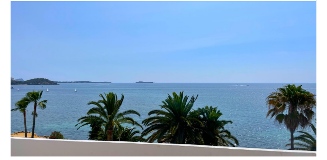
KPI1360 - Ático en venta - Penthouse zu verkaufen -Penthouse for sale - Penthouse te koop www.kensington-ibiza.com - Noelle Politiek