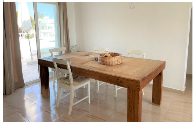
KPI1360 - Ático en venta - Penthouse zu verkaufen -Penthouse for sale - Penthouse te koop www.kensington-ibiza.com - Noelle Politiek