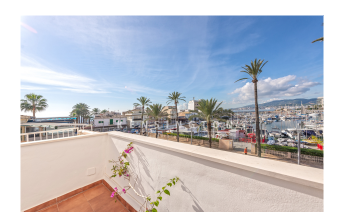
Penthouse in Portixol terrace