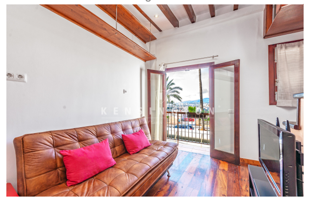
Penthouse in Portixol living room