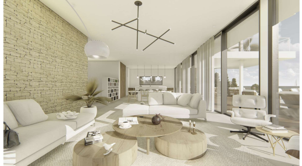
Living room in Cala Vinyas