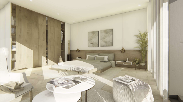
Bedroom in Cala Vinyas KPO01280