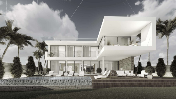
Project for a villa