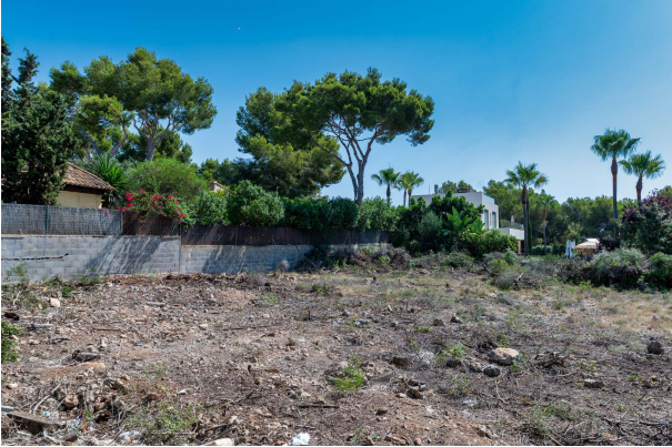
Plot Sol de Mallorca 4