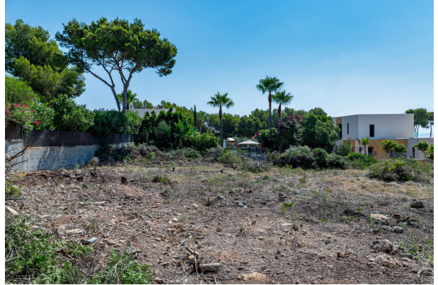
Plot Sol de Mallorca 5