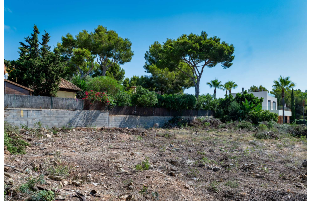
Plot Sol de Mallorca 2