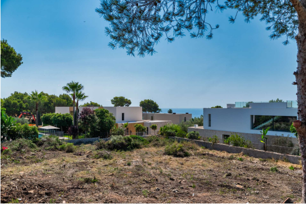
Plot Sol de Mallorca 8