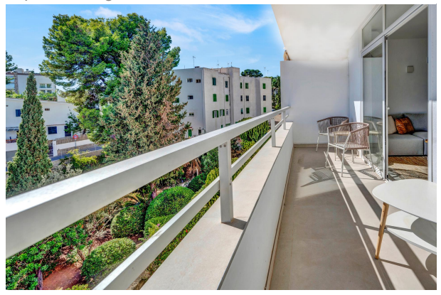
Open and big terrace with views