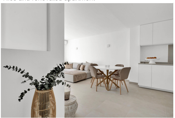
Nice and renovated apartment