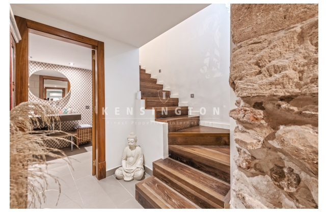
Bedroom III lower level