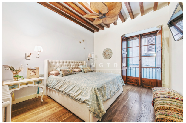
Bedroom II lower level