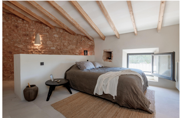
Master bedroom (1st floor)