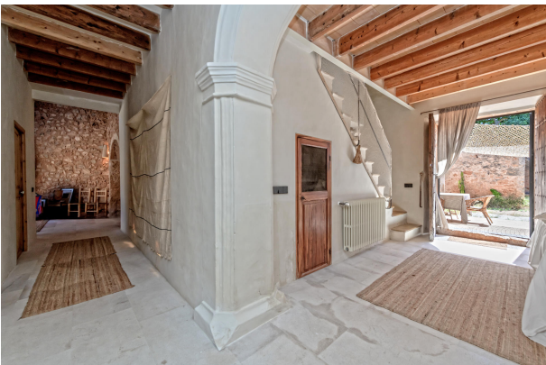
Bedroom 4 (ground floor)