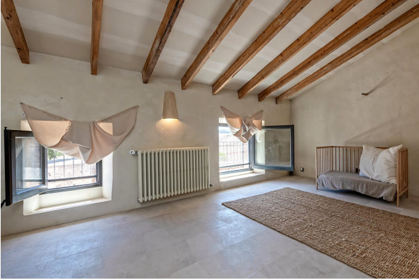
TV room (1st floor)