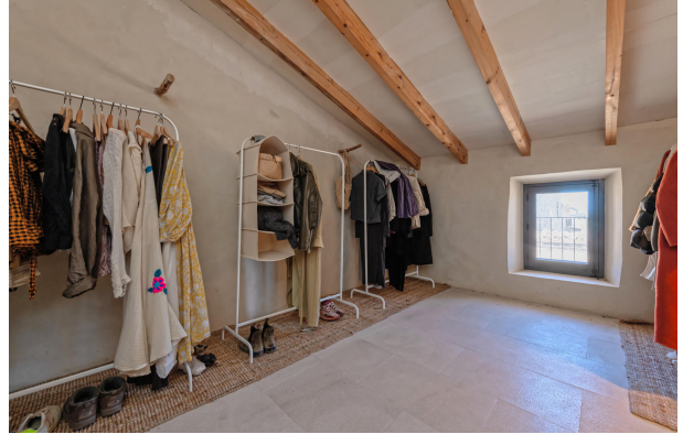
Bedroom 2 (1st floor)