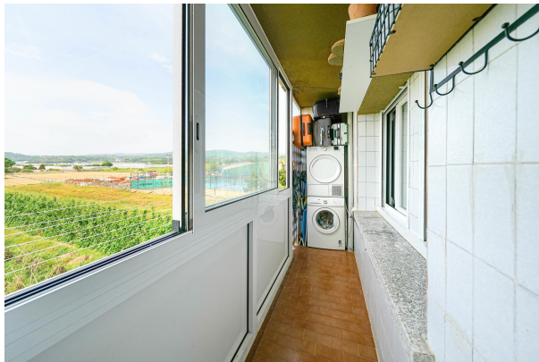
pis llavaneres 07.10.24 (15 de 21)