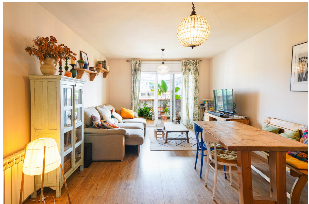
pis llavaneres 07.10.24 (12 de 21)