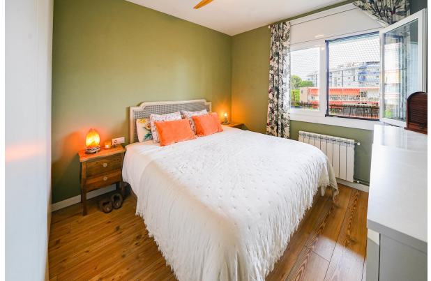
pis llavaneres 07.10.24 (3 de 21)