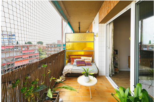
pis llavaneres 07.10.24 (10 de 21)