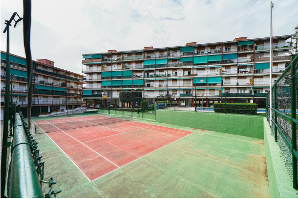
pis llavaneres 07.10.24 (16 de 21)