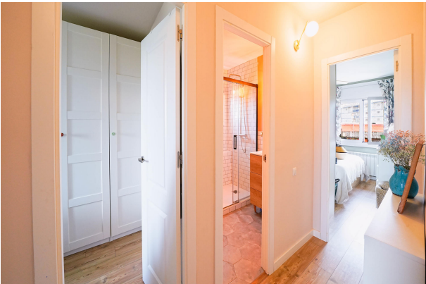
pis llavaneres 07.10.24 (7 de 21)