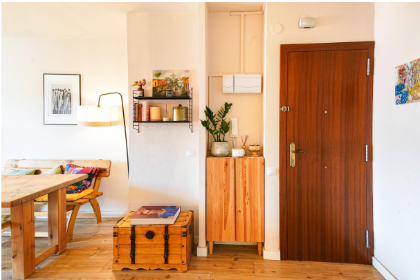
pis llavaneres 07.10.24 (9 de 21)