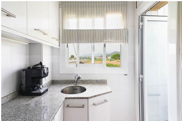
pis llavaneres 07.10.24 (6 de 21)