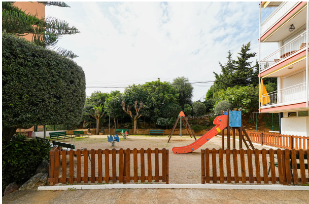
pis llavaneres 07.10.24 (20 de 21)