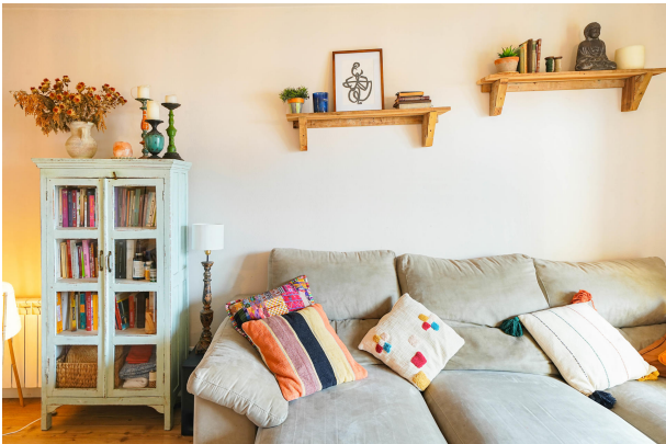
pis llavaneres 07.10.24 (13 de 21)