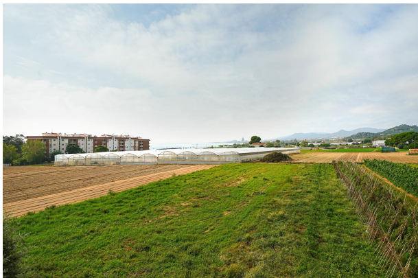
pis llavaneres 07.10.24 (18 de 21)