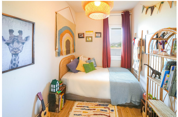
pis llavaneres 07.10.24 (5 de 21)