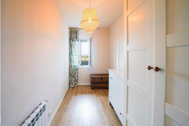
pis llavaneres 07.10.24 (1 de 21)