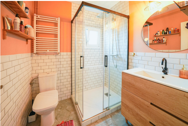
pis llavaneres 07.10.24 (4 de 21)