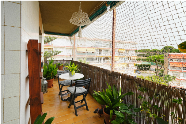
pis llavaneres 07.10.24 (1 de 1)