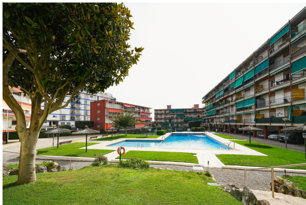
pis llavaneres 07.10.24 (19 de 21)