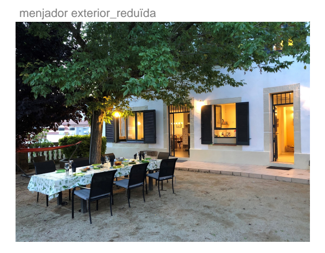
menjador exterior nou reduïda