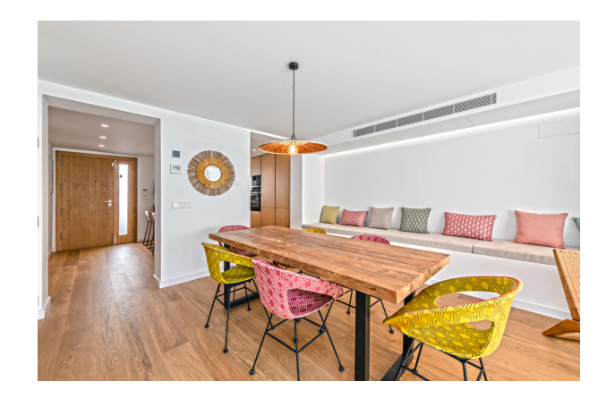
Family room 2nd floor