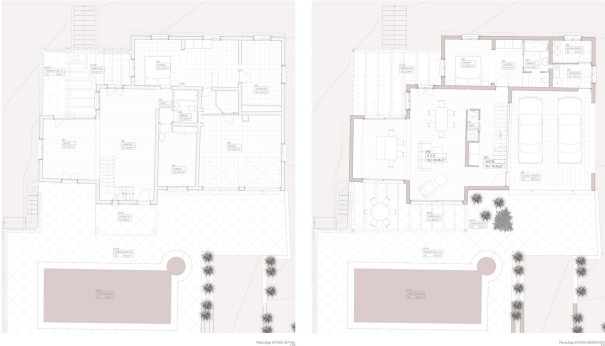
4. Ground floor plan