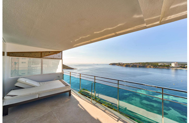
7. Terrace with sea views