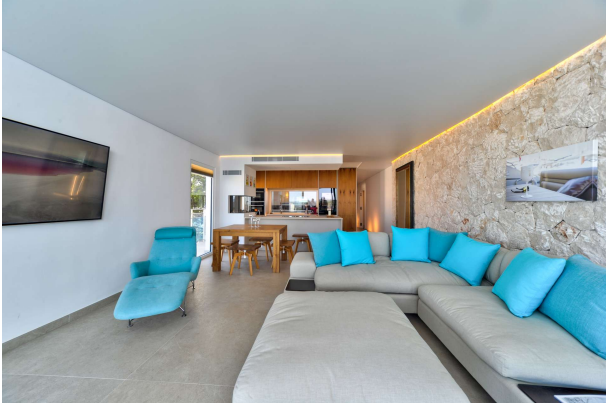
8. Living room