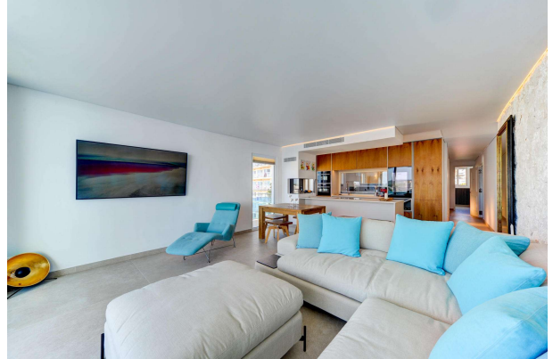
9. Living room