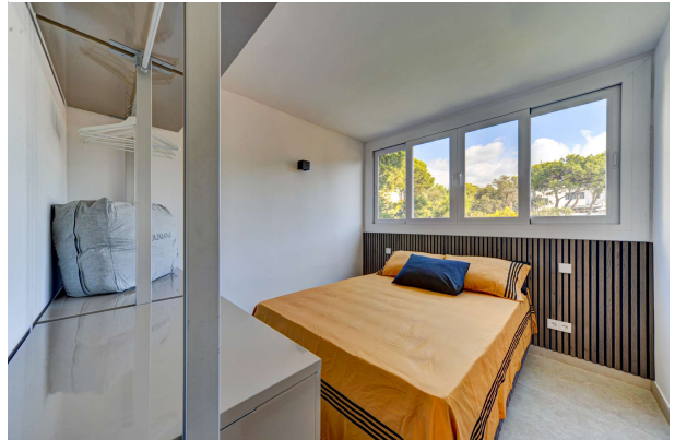
19. Guest bedroom in Torrenova