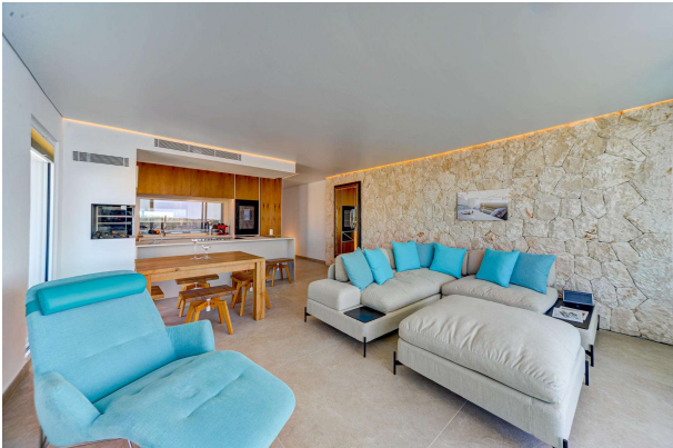
10. Living room