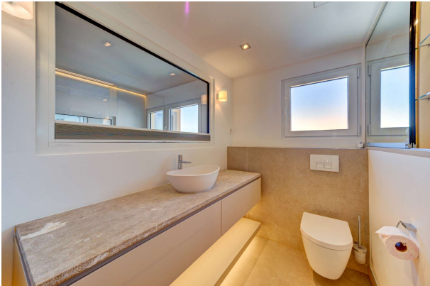
18. Bathroom in Torrenova