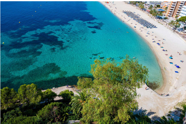
2. Sea views