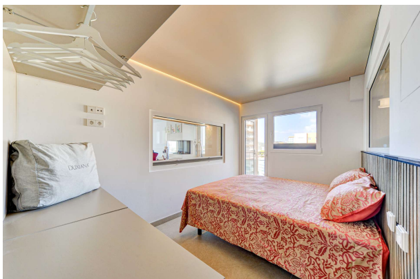
16. Master bedroom in Torrenova