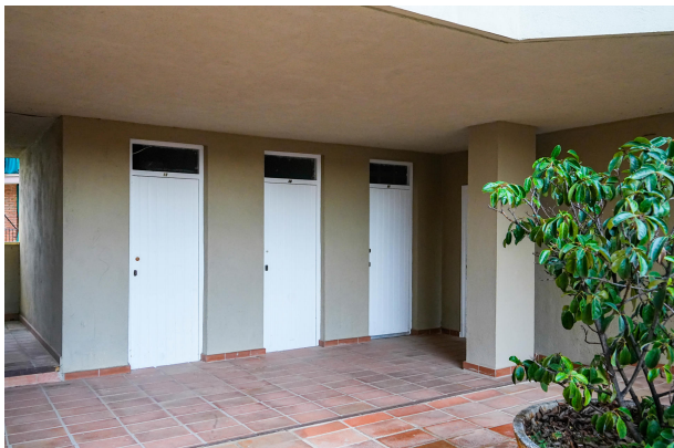
pis centre llavaneres (28 de 29)