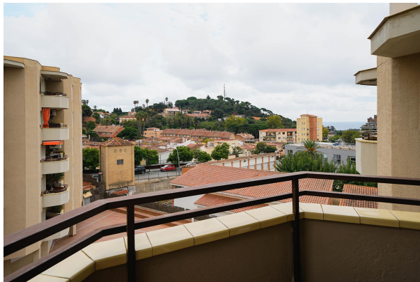
pis centre llavaneres (9 de 29)