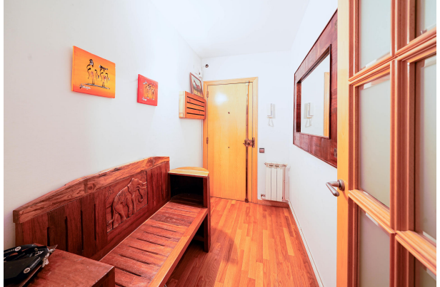
pis centre llavaneres (21 de 29)