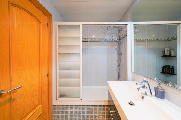
pis centre llavaneres (16 de 29)