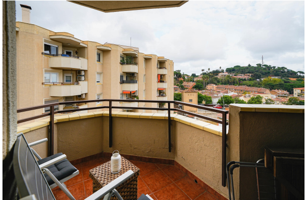
pis centre llavaneres (8 de 29)