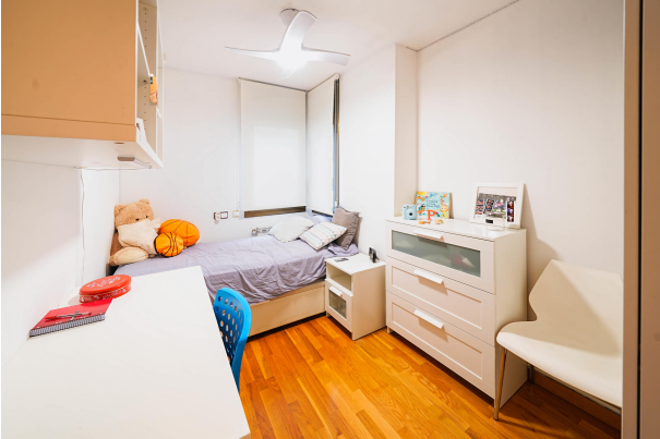
pis centre llavaneres (12 de 29)