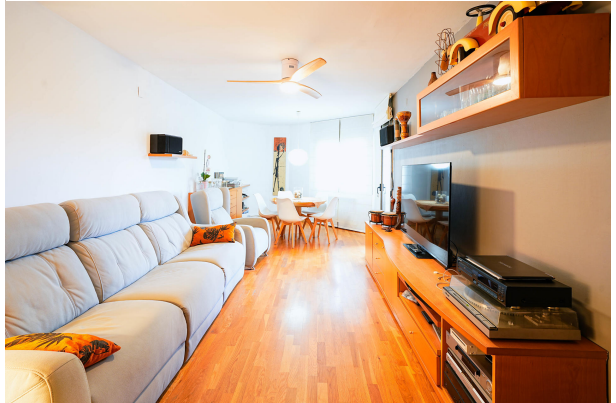
pis centre llavaneres (4 de 29)