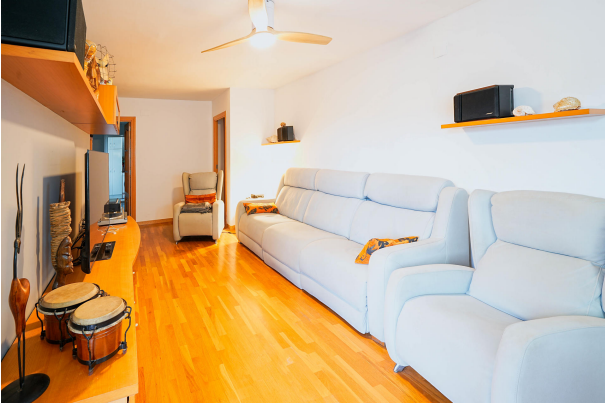
pis centre llavaneres (6 de 29)