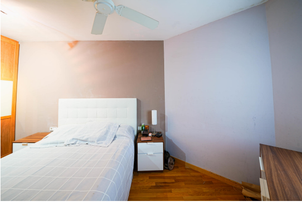
pis centre llavaneres (18 de 29)