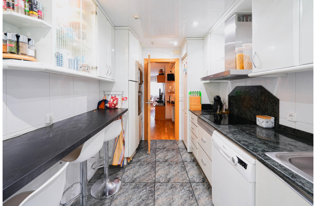
pis centre llavaneres (2 de 29)