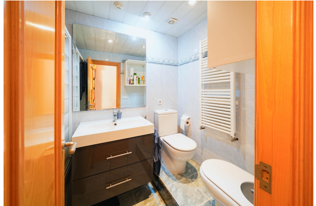
pis centre llavaneres (15 de 29)