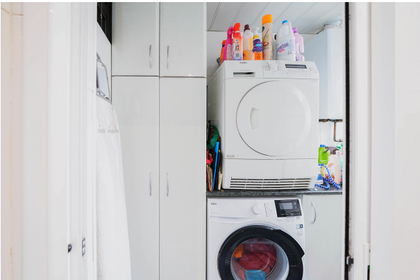
pis centre llavaneres (3 de 29)