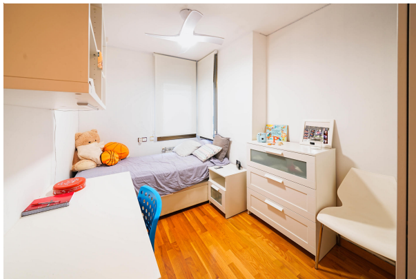
pis centre llavaneres (12 de 29)