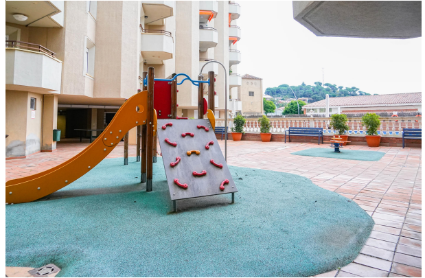
pis centre llavaneres (25 de 29)