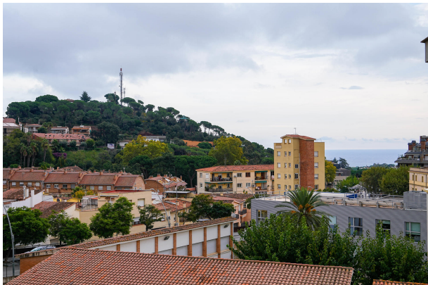
pis centre llavaneres (22 de 29)