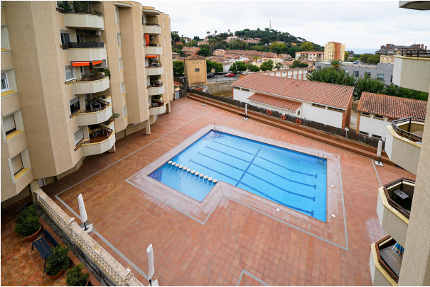
pis centre llavaneres (10 de 29)