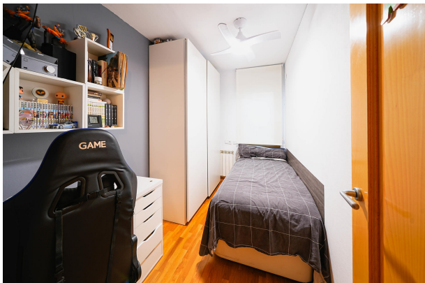
pis centre llavaneres (11 de 29)