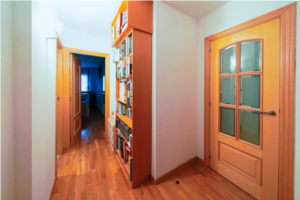
pis centre llavaneres (14 de 29)