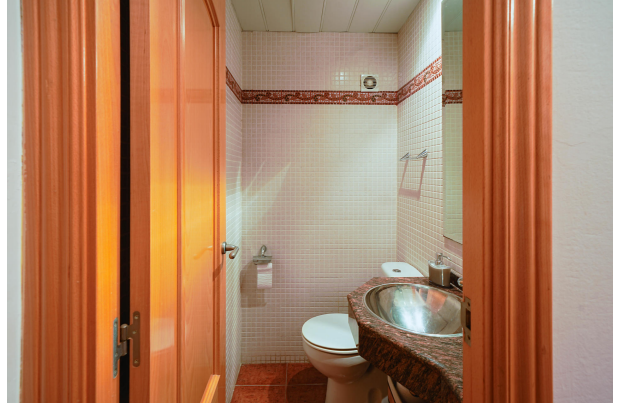
pis centre llavaneres (13 de 29)