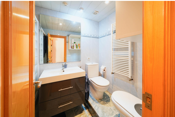
pis centre llavaneres (15 de 29)