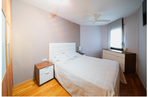
pis centre llavaneres (19 de 29)