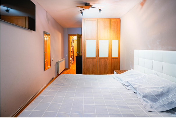
pis centre llavaneres (17 de 29)