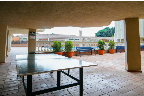
pis centre llavaneres (24 de 29)