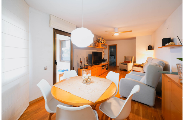
pis centre llavaneres (7 de 29)