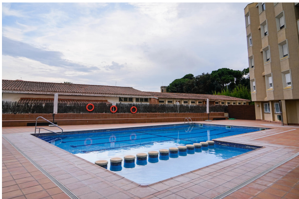
pis centre llavaneres (26 de 29)