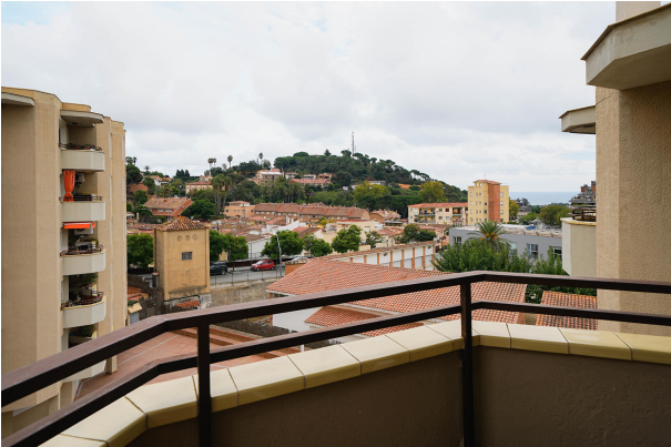
pis centre llavaneres (9 de 29)