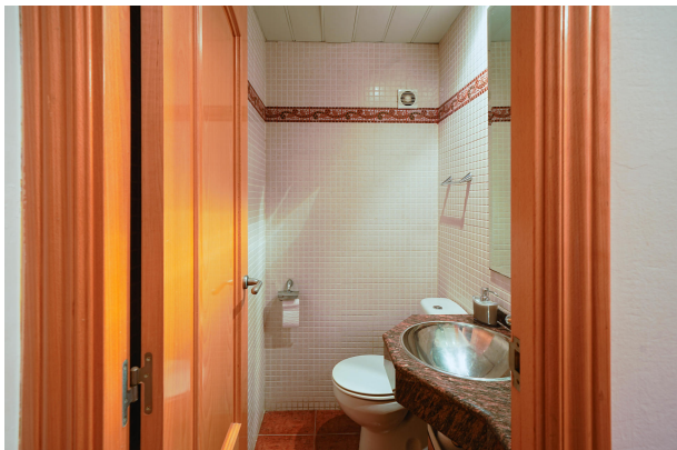
pis centre llavaneres (13 de 29)