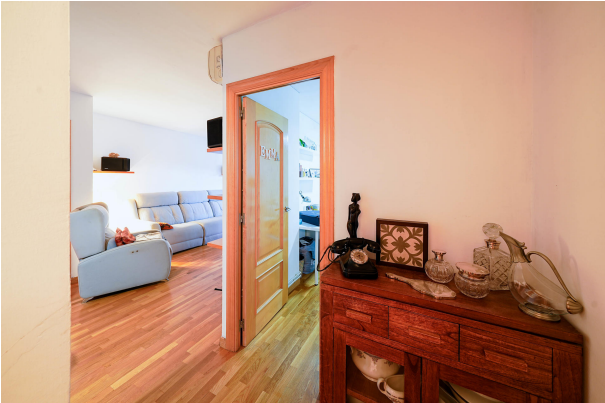
pis centre llavaneres (20 de 29)