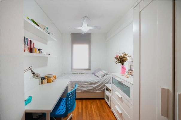
pis centre llavaneres (1 de 29)