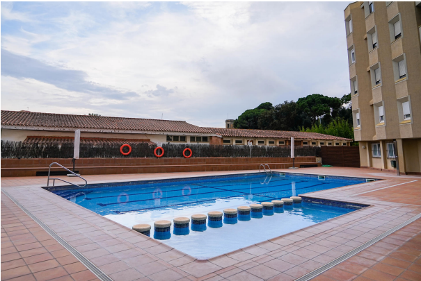
pis centre llavaneres (26 de 29)