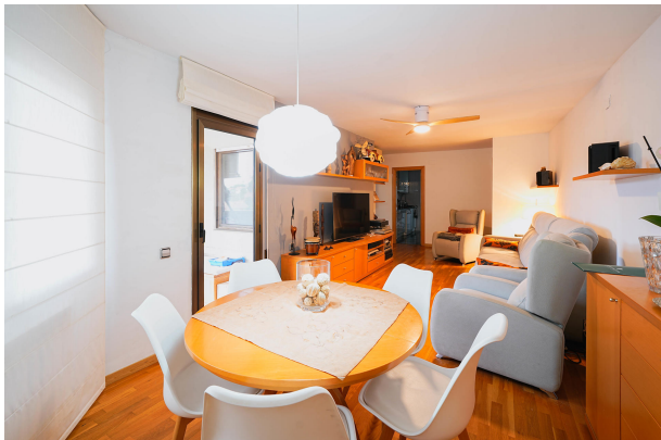
pis centre llavaneres (7 de 29)