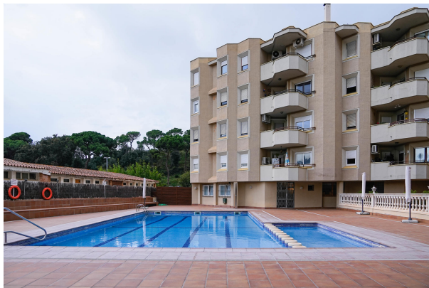
pis centre llavaneres (27 de 29)