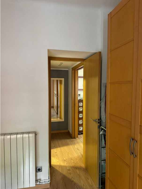
WhatsApp Image 2024-09-23 at 12.39.07 (1)