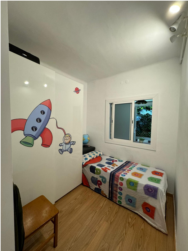
WhatsApp Image 2024-09-23 at 12.39.09