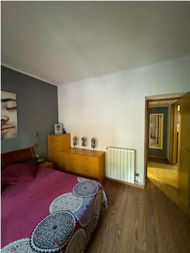
WhatsApp Image 2024-09-23 at 12.39.06 (1)