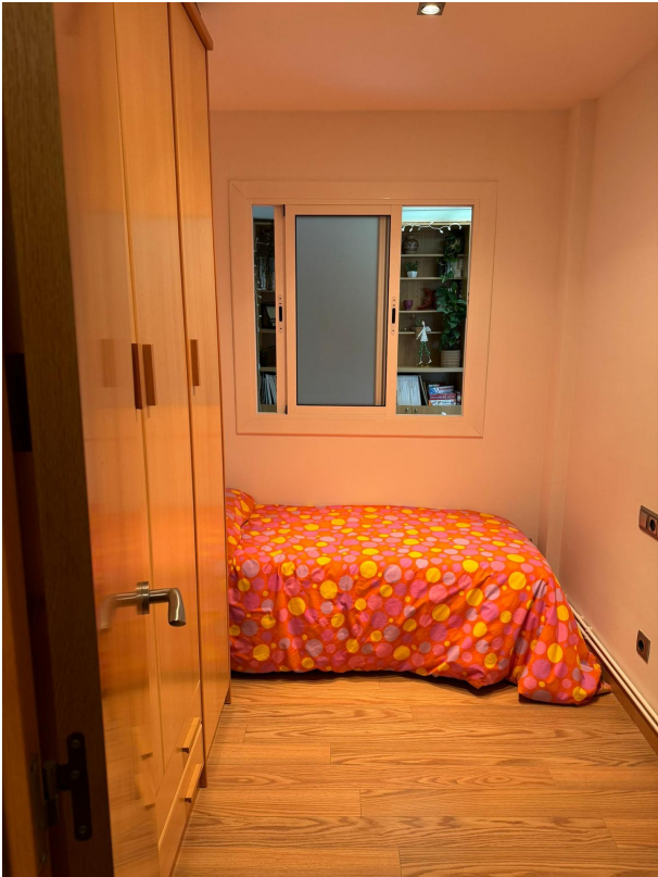
WhatsApp Image 2024-09-23 at 12.39.13