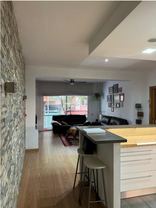
WhatsApp Image 2024-09-23 at 12.39.14