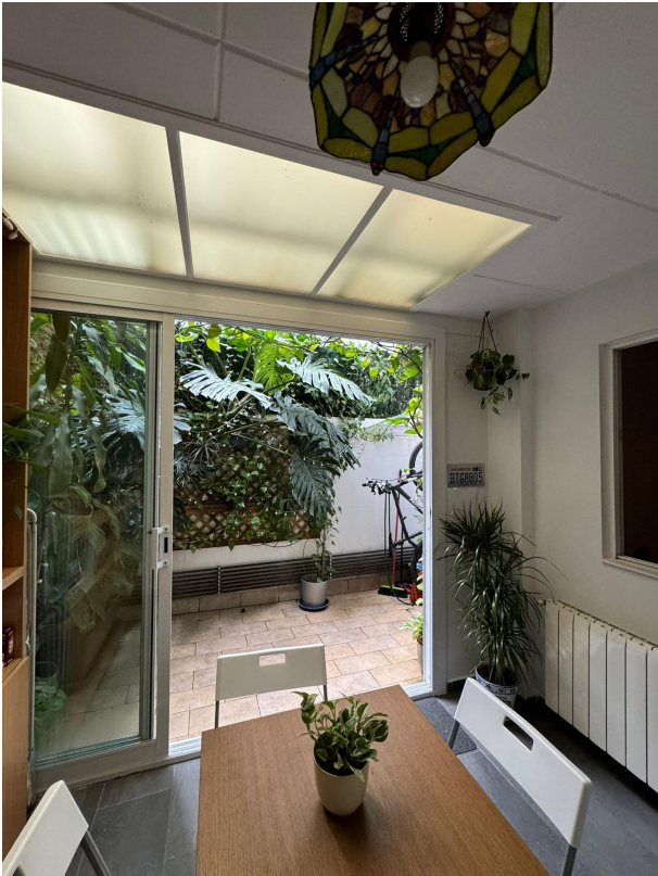
WhatsApp Image 2024-09-23 at 12.39.12