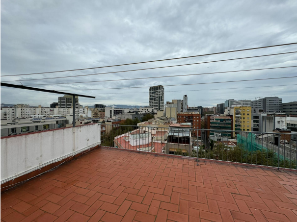
WhatsApp Image 2024-09-23 at 12.39.14 (2)