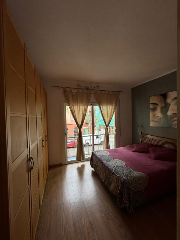
WhatsApp Image 2024-09-23 at 12.39.16 (2)