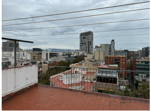
WhatsApp Image 2024-09-23 at 12.39.14 (1)