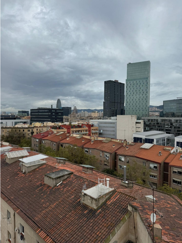
WhatsApp Image 2024-09-23 at 12.39.16