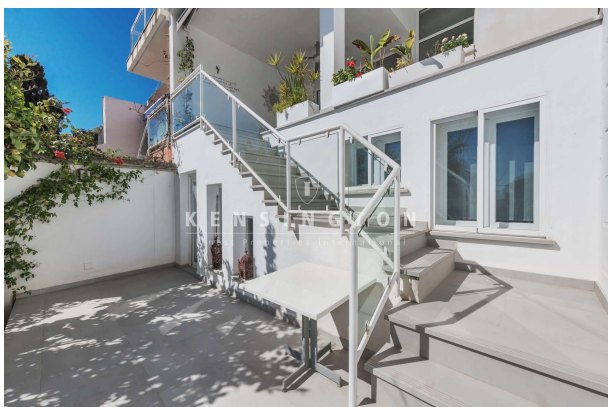
Terrace in front of souterrain