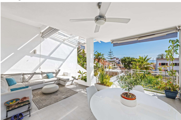
Living room terrace