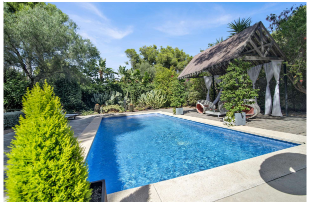
Villa mit Pool