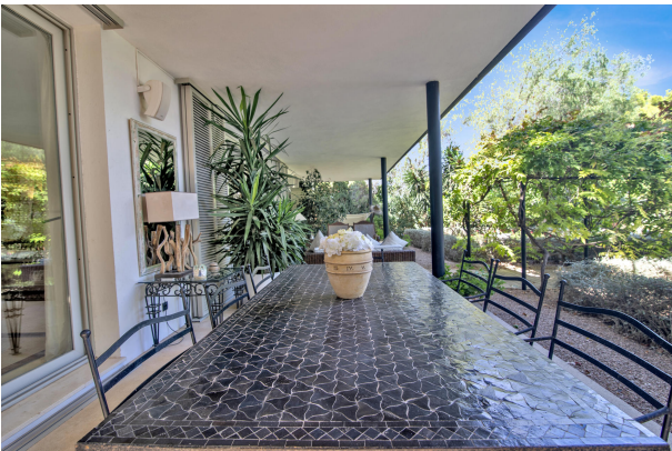
Modern villa with great outdoor area