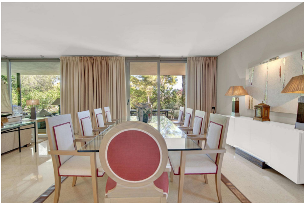
Schöner und heller Essbereich