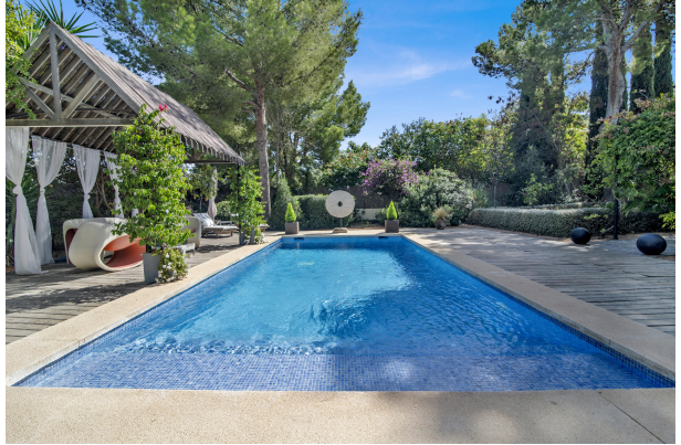
Modern villa with great outdoor area