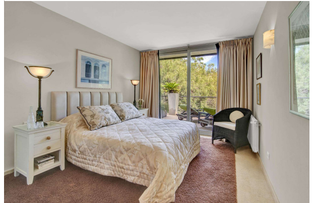
Schönes und grosses Schlafzimmer