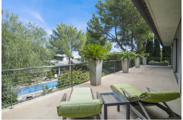
Beautiful outdoor area