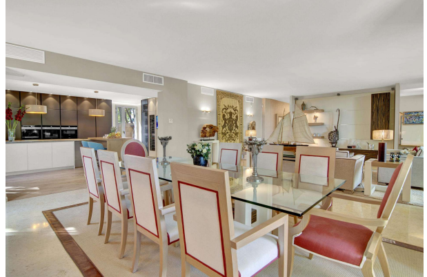
Helles und freundliches Essbereich