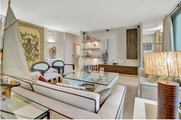
Cozy and spacious living room