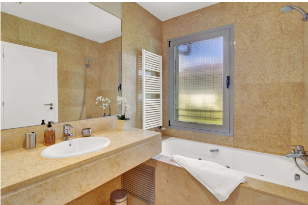
Helles und grosszügiges Badezimmer