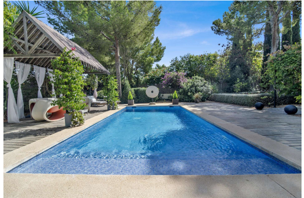
Villa mit schönem Pool