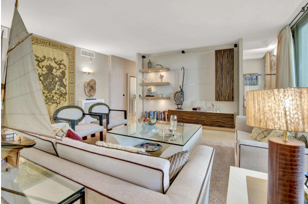
Gemütliches und grosses Wohnzimmer