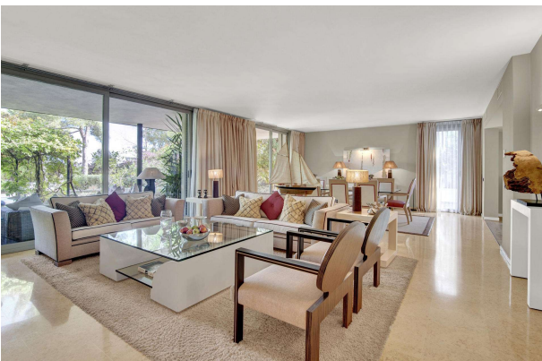
Lichtdurchflütendes Wohnzimmer Villa Sol de Mallorca