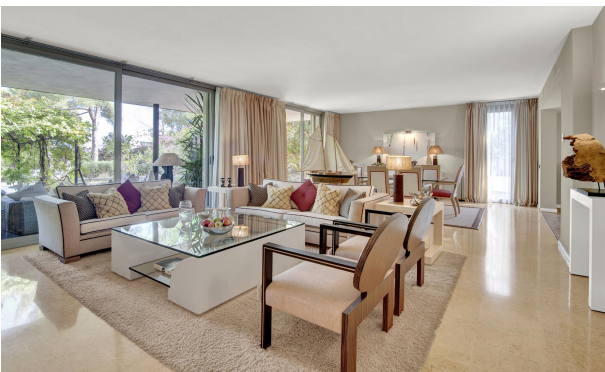
Light-flooded living room Villa Sol de Mallorca villa in Sol de Mallorca