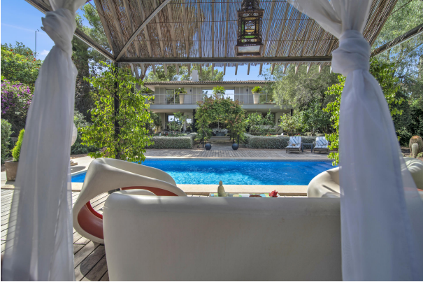
Modern villa with a beautiful outdoor area