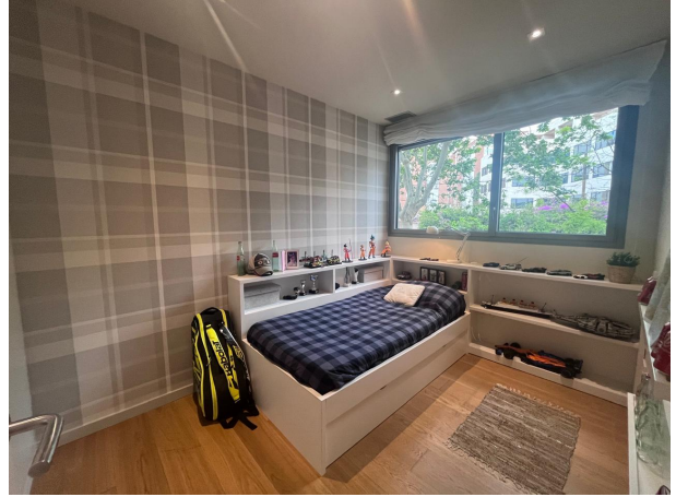
21. HABITACION 3