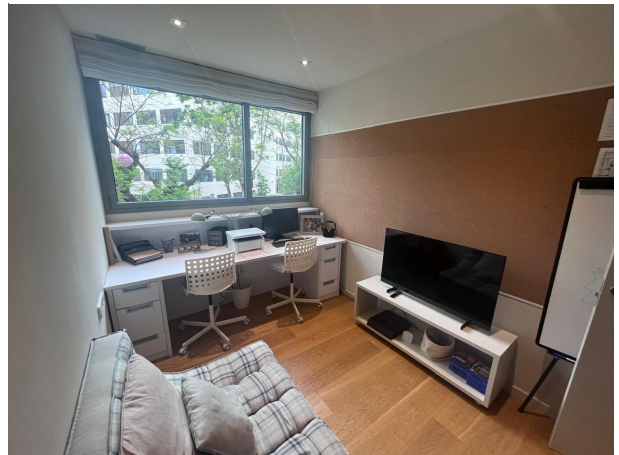
23. HABITACION 4