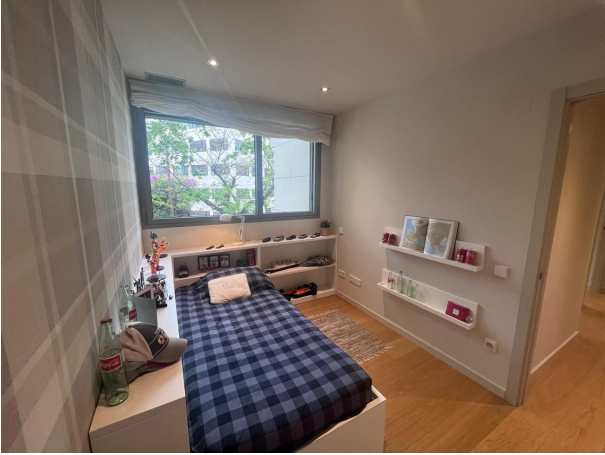
20. HABITACION 3