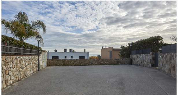
191202-Vivenda HIGH 062