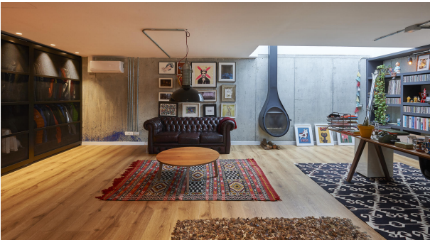
191202-Vivenda HIGH 012