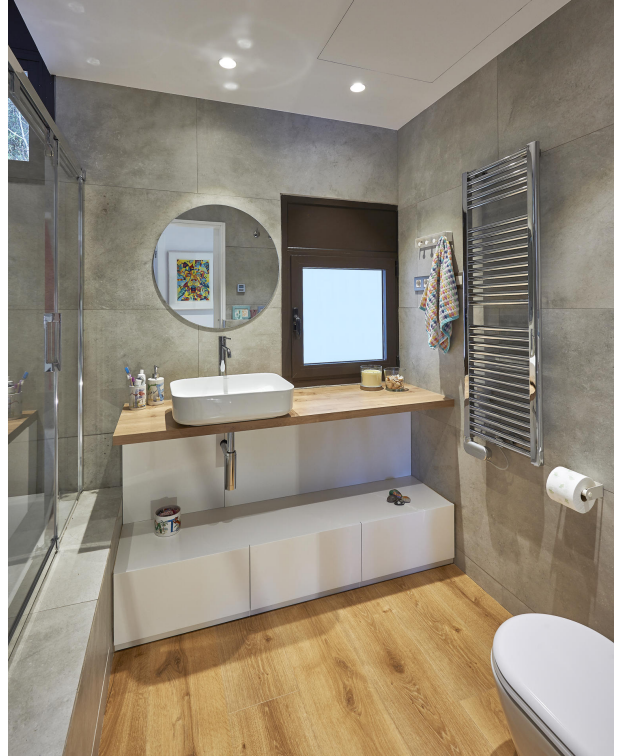
191202-Vivenda HIGH 047