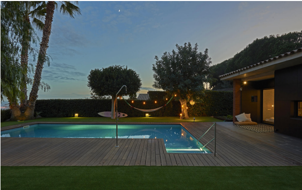
191202-Vivenda HIGH 070