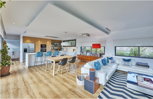
191202-Vivenda HIGH 020