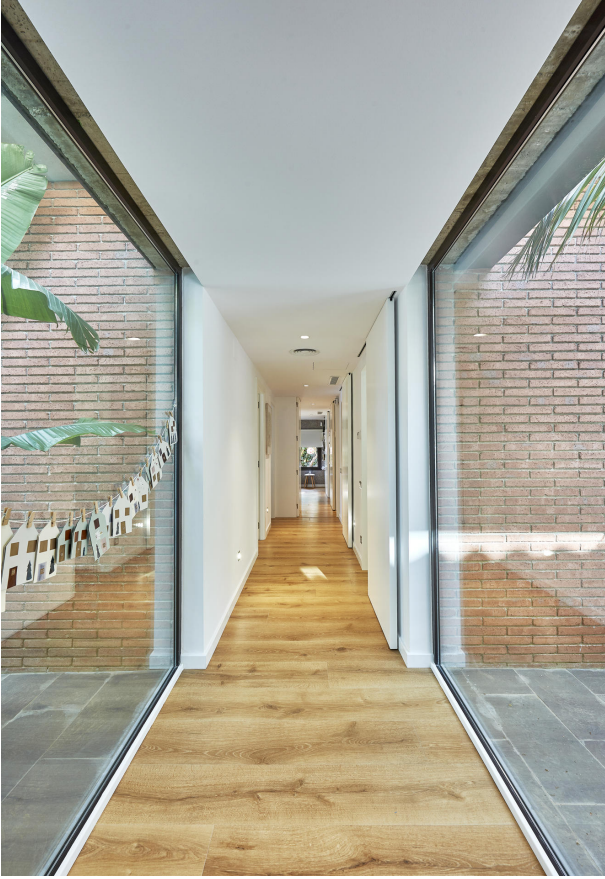
191202-Vivenda HIGH 036