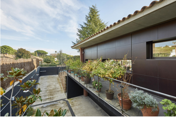
191202-Vivenda HIGH 046