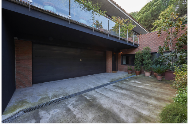
191202-Vivenda HIGH 056