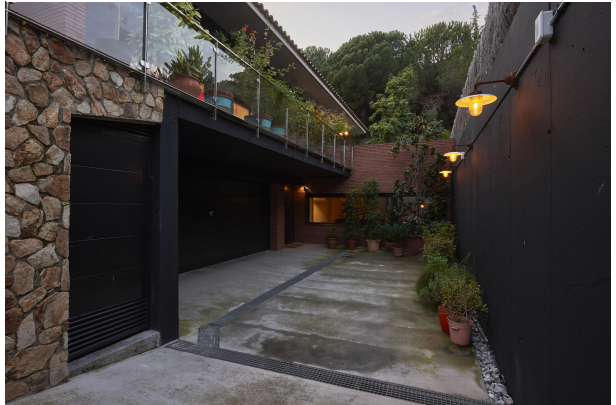
191202-Vivenda HIGH 064