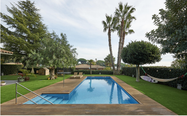
191202-Vivenda HIGH 002