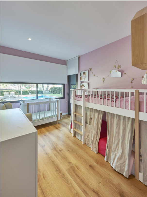
191202-Vivenda HIGH 048