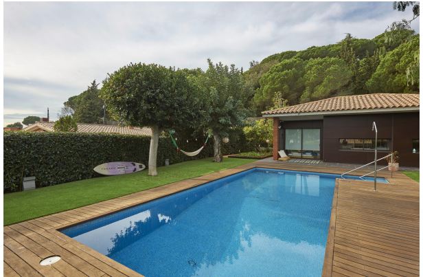
191202-Vivenda HIGH 005