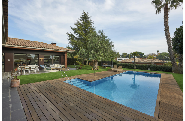
191202-Vivenda HIGH 003