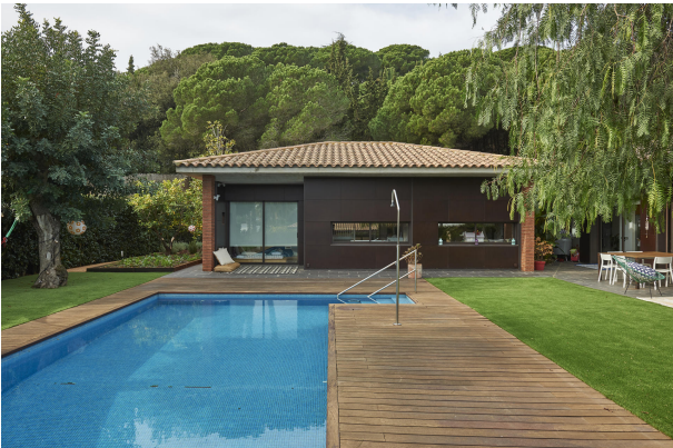
191202-Vivenda HIGH 006