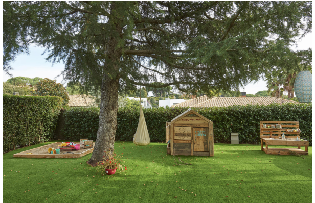
191202-Vivenda HIGH 009