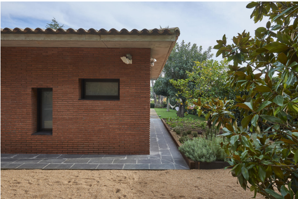
191202-Vivenda HIGH 010