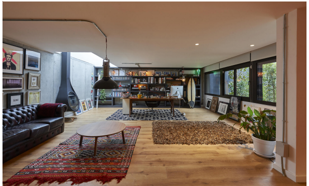
191202-Vivenda HIGH 011