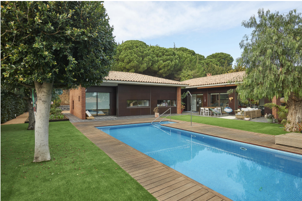
191202-Vivenda HIGH 004