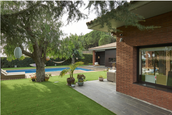
191202-Vivenda HIGH 008