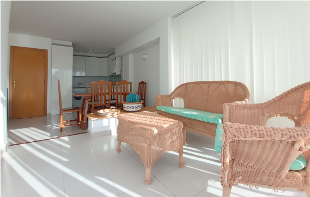
KPI1356 - Apartamento en venta - Appartement zu verkaufen - Apartment for sale - Appartement te koop - www.kensington-ibiza.com - Noelle Politiek