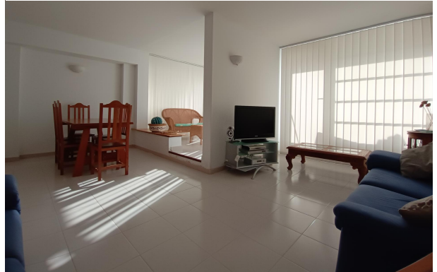
IKPI1356 - Apartamento en venta - Appartement zu verkaufen - Apartment for sale - Appartement te koop - www.kensington-ibiza.com - Noelle Politiek