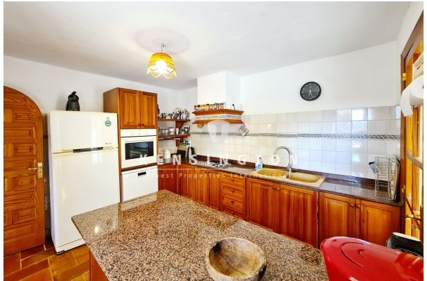
11 Küche 2