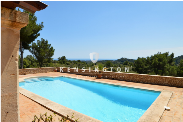
18 Pool 1