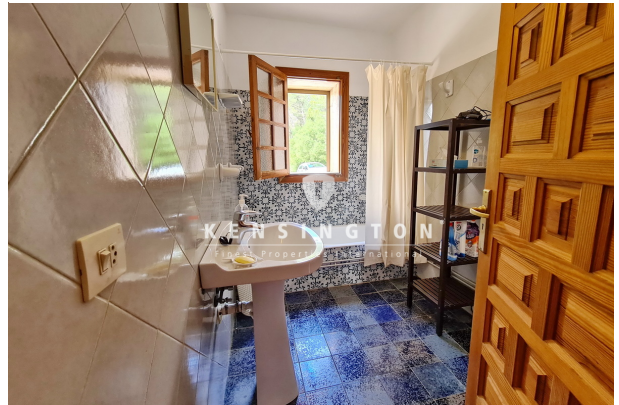
7 Bad Eingang links