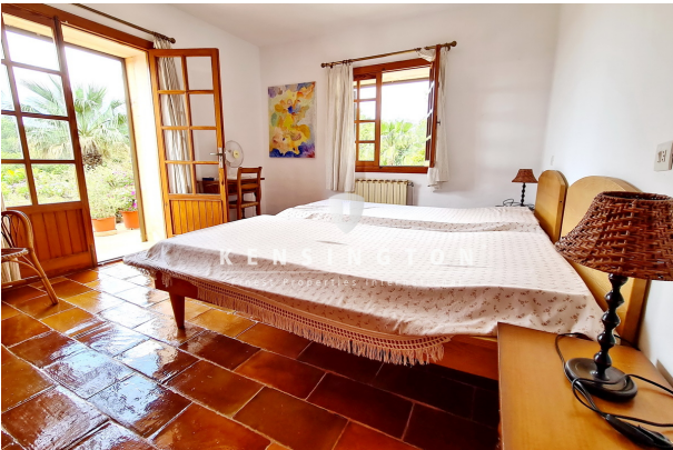
6 Schlafzimmer unten links 2