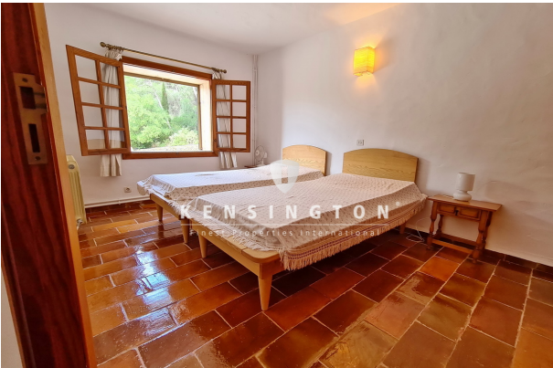
8 Schlafzimmer unten rechts 1