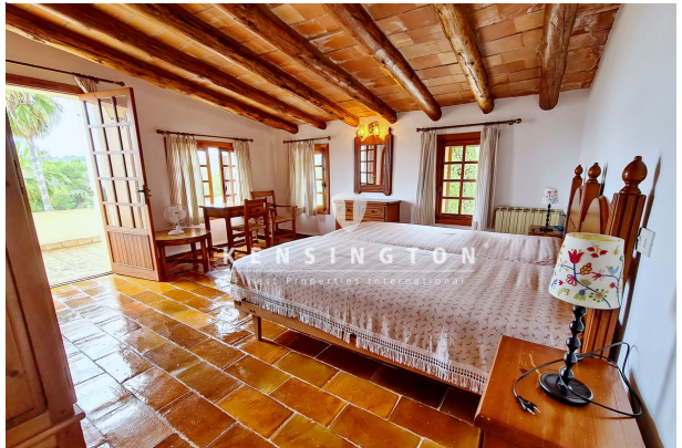
13 Schlafzimmer 1 Etage b