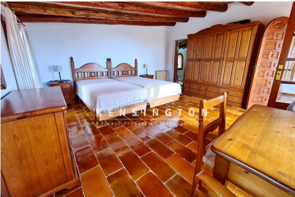
12 Schlafzimmer 1 Etage a