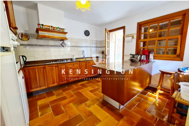
10 Küche 1