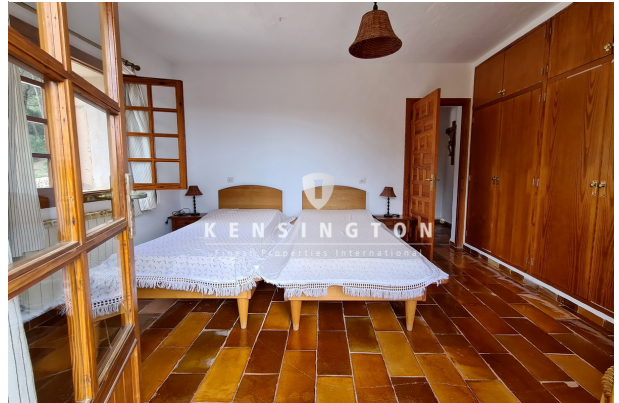
5 Schlafzimmer unten links 1