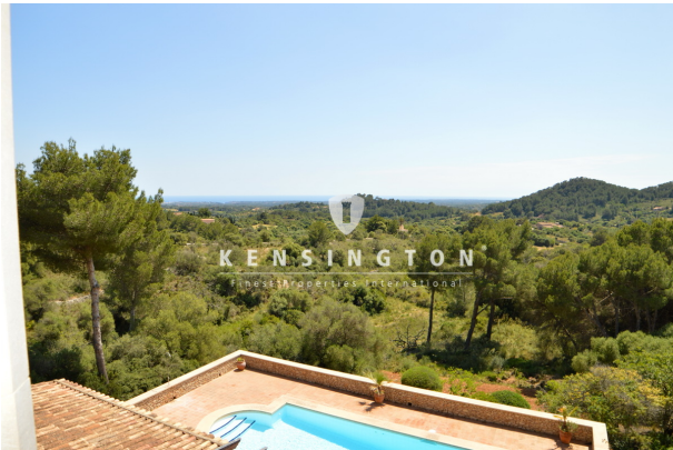
14 Aussicht 1 Etage a