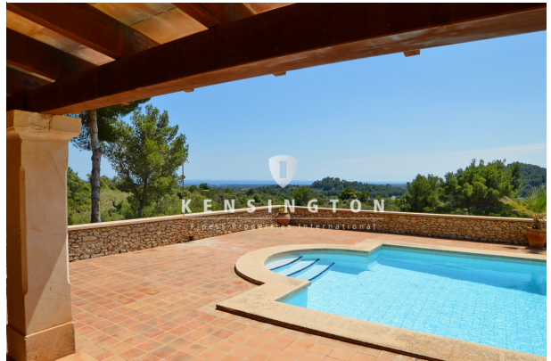
19 Pool 2