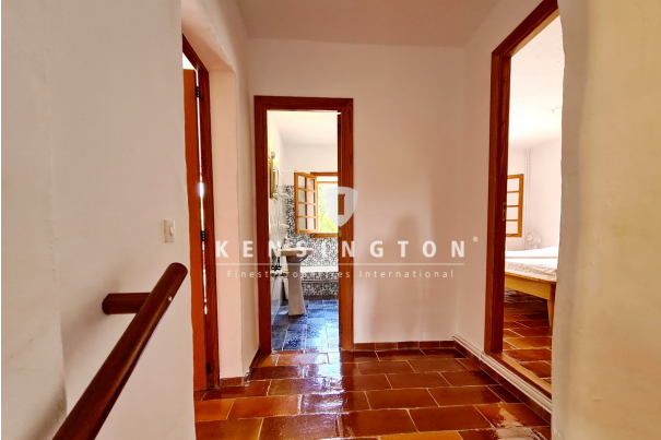
4 Eingang links