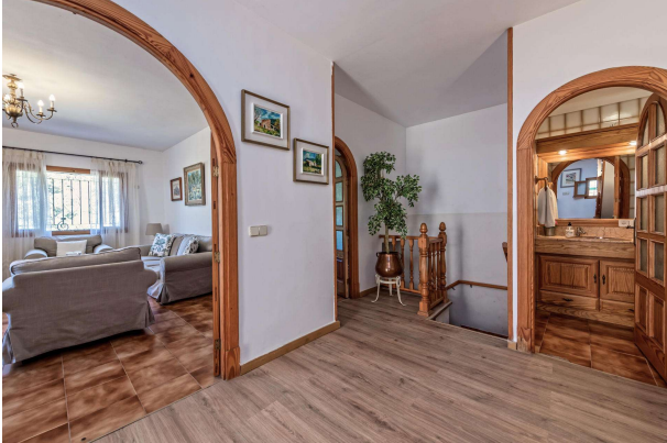
House 1: Bedroom II