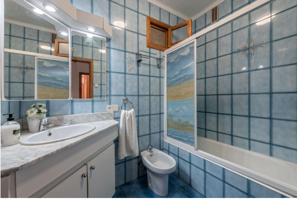
House 1: bathroom