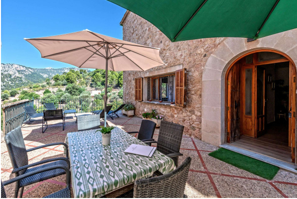
House 1: basement