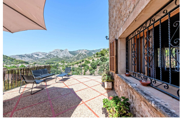
House 1: living