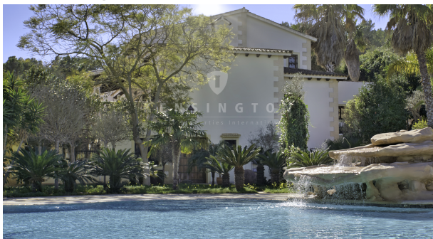
18 - KPI1200 - Finca en venta - Finca zu verkaufen - Finca for sale - Finca te koop - www.kensington-ibiza.com - Noelle Politiek