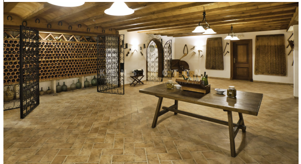
25 - KPI1200 - Finca en venta - Finca zu verkaufen - Finca for sale - Finca te koop - www.kensington-ibiza.com - Noelle Politiek