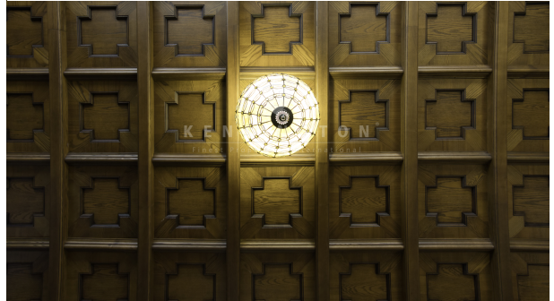
23 - KPI1200 - Finca en venta - Finca zu verkaufen - Finca for sale - Finca te koop - www.kensington-ibiza.com - Noelle Politiek