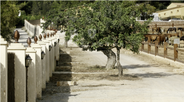
04 - KPI1200 - Finca en venta - Finca zu verkaufen - Finca for sale - Finca te koop - www.kensington-ibiza.com - Noelle Politiek