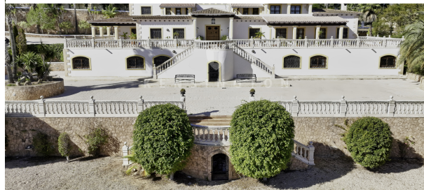
17 - KPI1200 - Finca en venta - Finca zu verkaufen - Finca for sale - Finca te koop - www.kensington-ibiza.com - Noelle Politiek