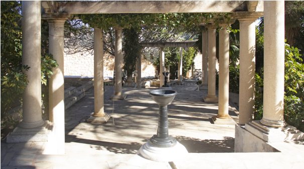
28 - KPI1200 - Finca en venta - Finca zu verkaufen - Finca for sale - Finca te koop - www.kensington-ibiza.com - Noelle Politiek