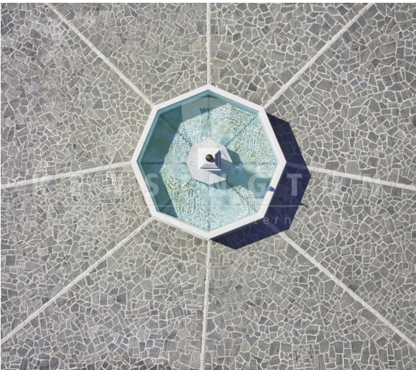
08 - KPI1200 - Finca en venta - Finca zu verkaufen - Finca for sale - Finca te koop - www.kensington-ibiza.com - Noelle Politiek