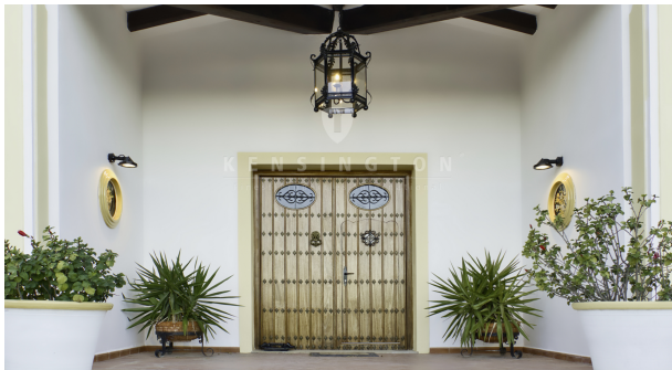
20 - KPI1200 - Finca en venta - Finca zu verkaufen - Finca for sale - Finca te koop - www.kensington-ibiza.com - Noelle Politiek