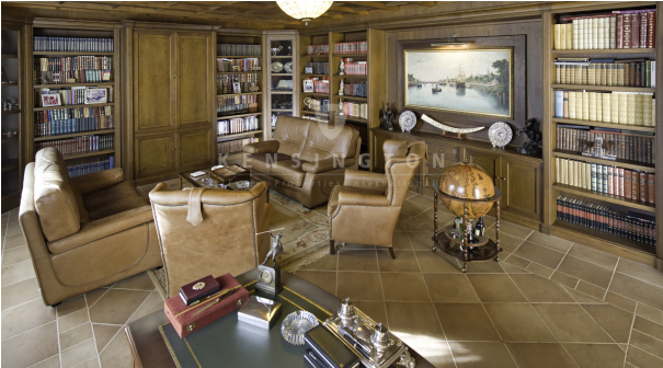
22 - KPI1200 - Finca en venta - Finca zu verkaufen - Finca for sale - Finca te koop - www.kensington-ibiza.com - Noelle Politiek