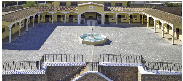
07 - KPI1200 - Finca en venta - Finca zu verkaufen - Finca for sale - Finca te koop - www.kensington-ibiza.com - Noelle Politiek