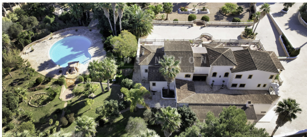
16 - KPI1200 - Finca en venta - Finca zu verkaufen - Finca for sale - Finca te koop - www.kensington-ibiza.com - Noelle Politiek