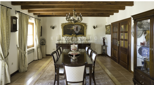
26 - KPI1200 - Finca en venta - Finca zu verkaufen - Finca for sale - Finca te koop - www.kensington-ibiza.com - Noelle Politiek