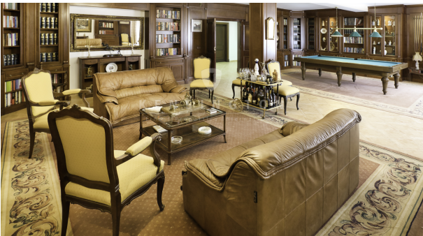
24 - KPI1200 - Finca en venta - Finca zu verkaufen - Finca for sale - Finca te koop - www.kensington-ibiza.com - Noelle Politiek