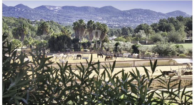
05 - KPI1200 - Finca en venta - Finca zu verkaufen - Finca for sale - Finca te koop - www.kensington-ibiza.com - Noelle Politiek