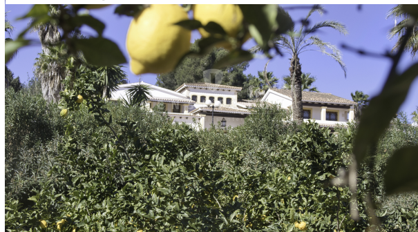
19 - KPI1200 - Finca en venta - Finca zu verkaufen - Finca for sale - Finca te koop - www.kensington-ibiza.com - Noelle Politiek