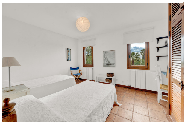
Guest bedroom in Sol de Mallorca