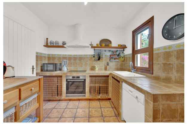
Kitchen in a villa for sale