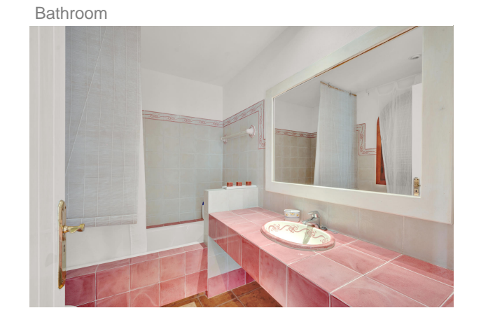
Bathroom in a villa for sale