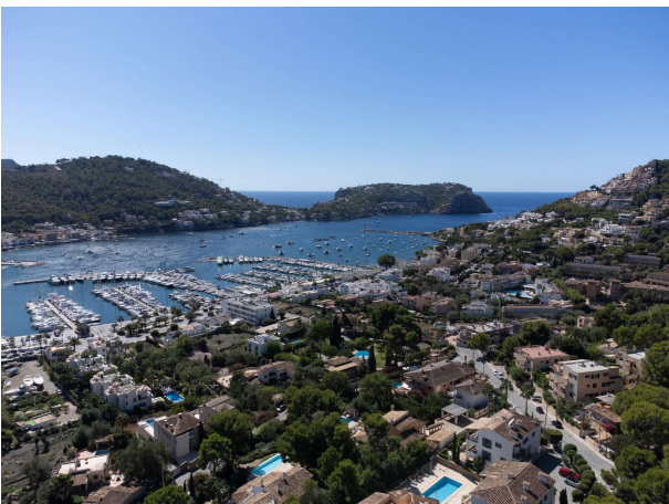
Grundstück mit Aussicht, Port Andratx Mallorca