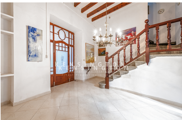
Townhouse in Porreres living room