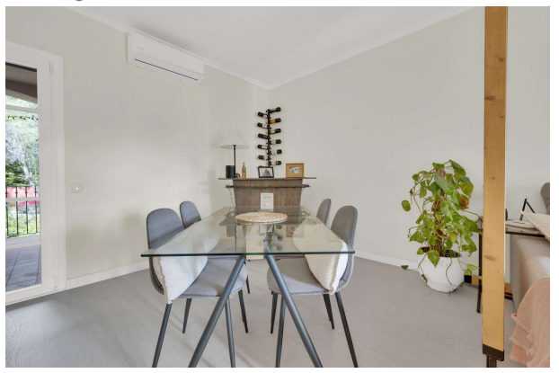
Dinning area in Bendinat