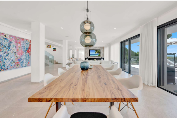
Villa in Bendinat 26