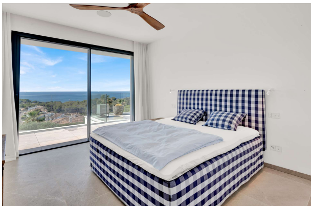
Villa in Bendinat 52