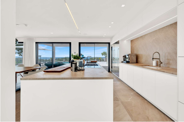
Villa in Bendinat 23