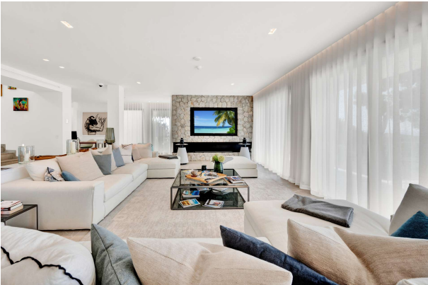
Villa in Bendinat 32