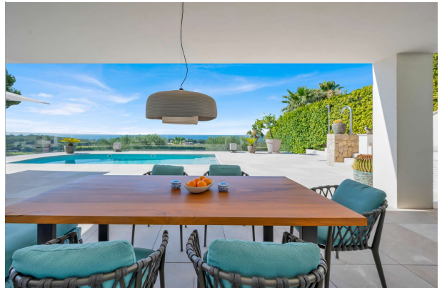
Villa in Bendinat 12