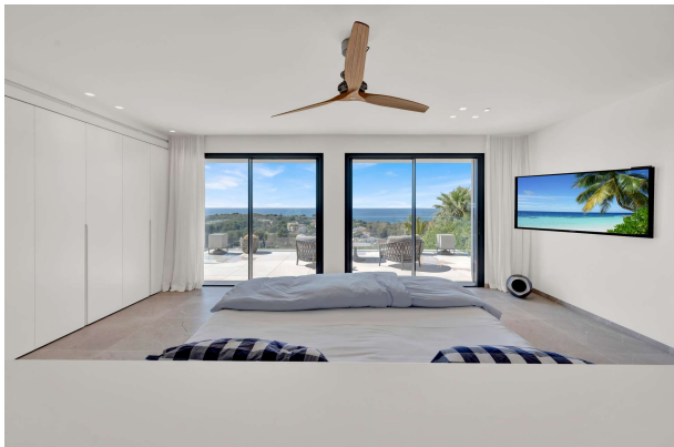
Villa in Bendinat 51