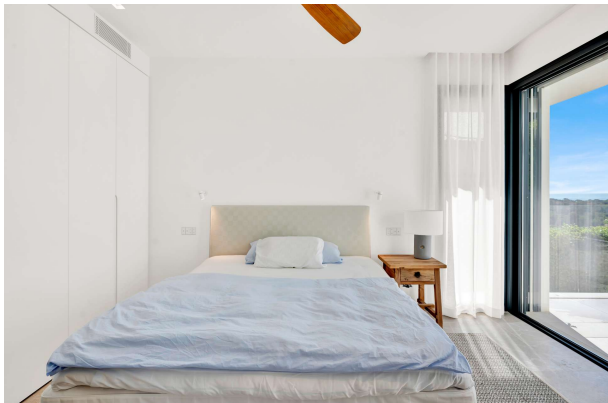
Villa in Bendinat 54