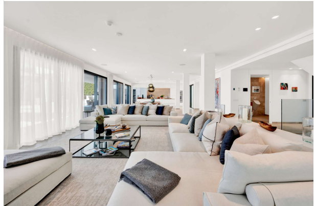
Villa in Bendinat 31