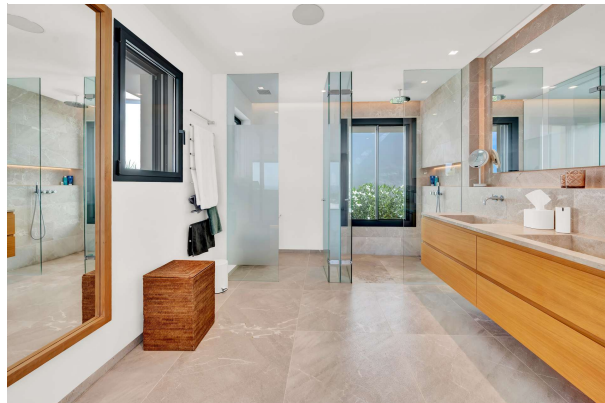
Villa in Bendinat 50