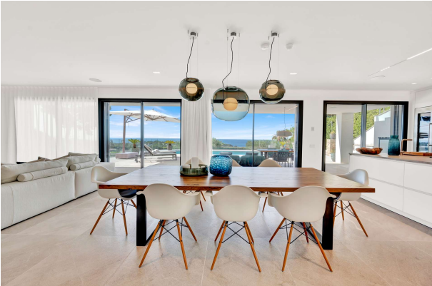
Villa in Bendinat 20