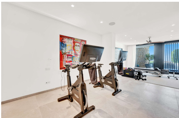
Villa in Bendinat 63