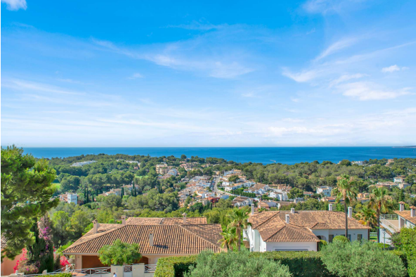
Villa in Bendinat 77