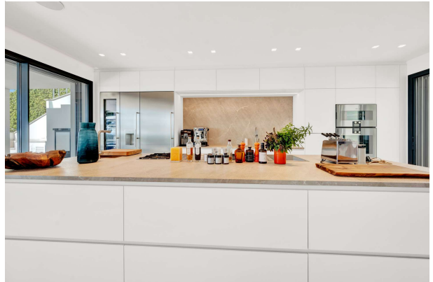
Villa in Bendinat 25