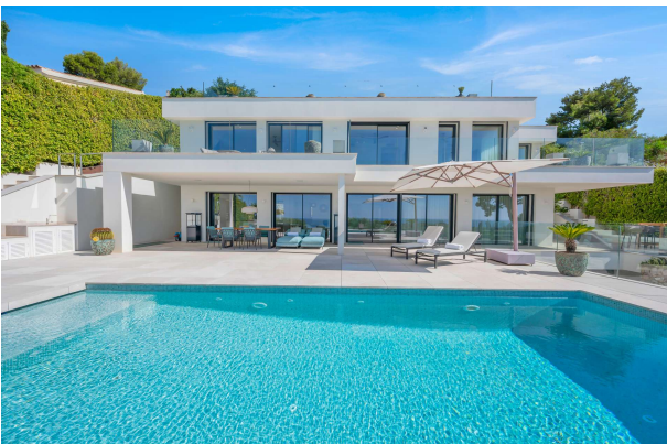
Villa in Bendinat 8