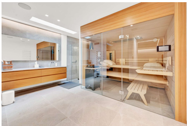
Villa in Bendinat 61