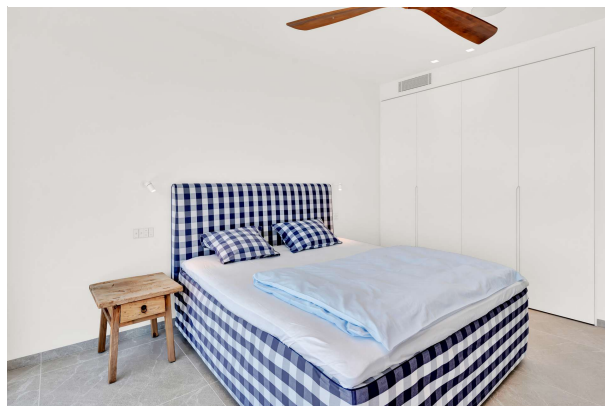
Villa in Bendinat 56