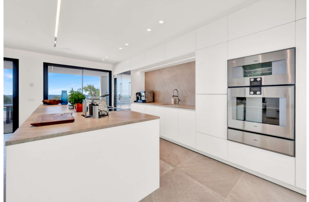
Villa in Bendinat 22