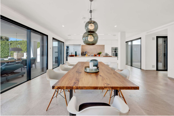
Villa in Bendinat 36