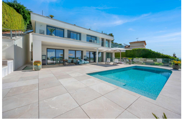
Villa in Bendinat 14