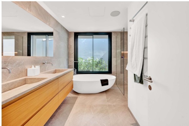
Villa in Bendinat 44