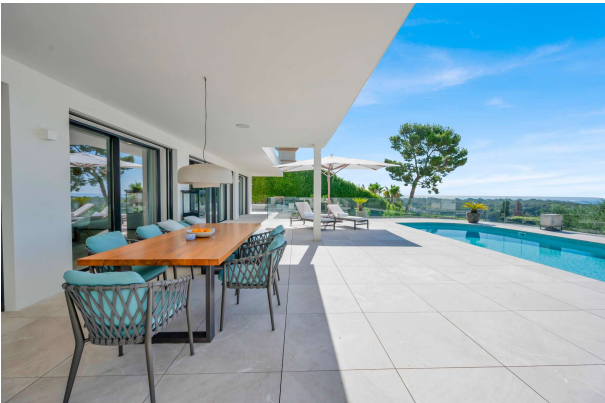
Villa in Bendinat 13