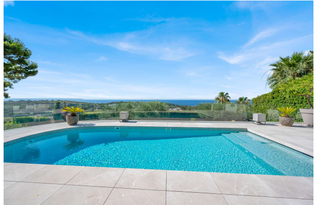
Villa in Bendinat 6