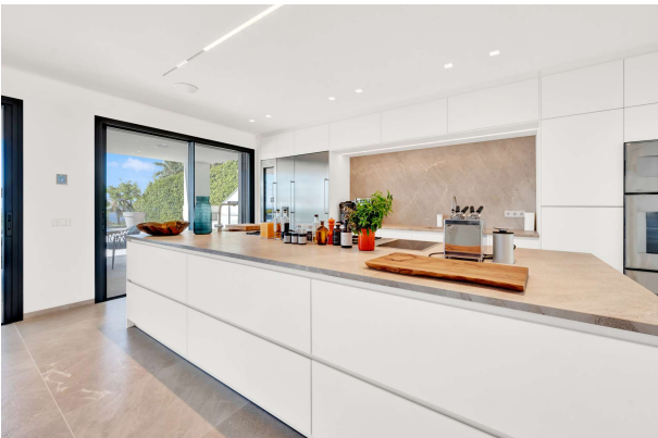
Villa in Bendinat 24