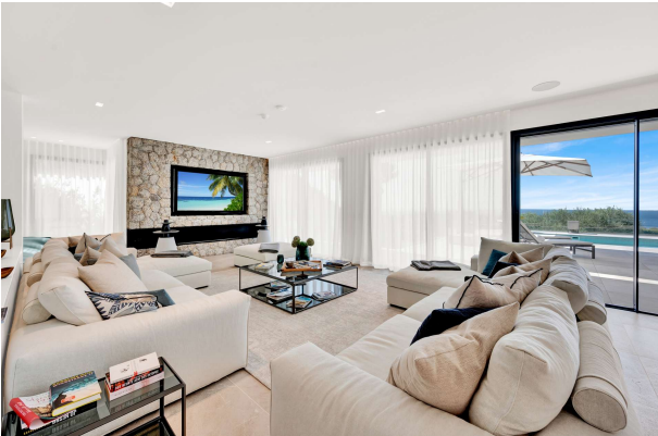
Villa in Bendinat 30