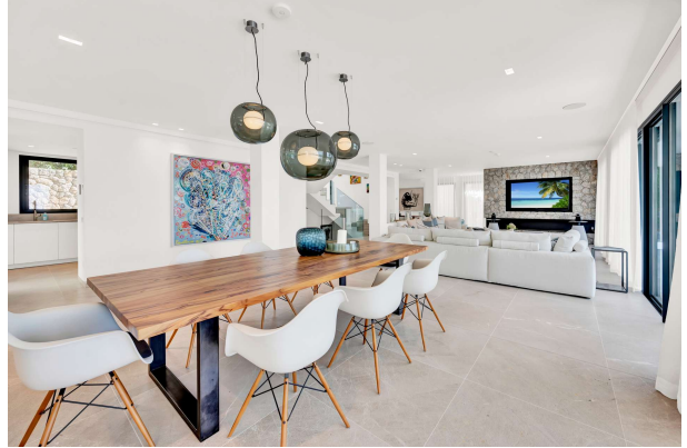
Villa in Bendinat 27