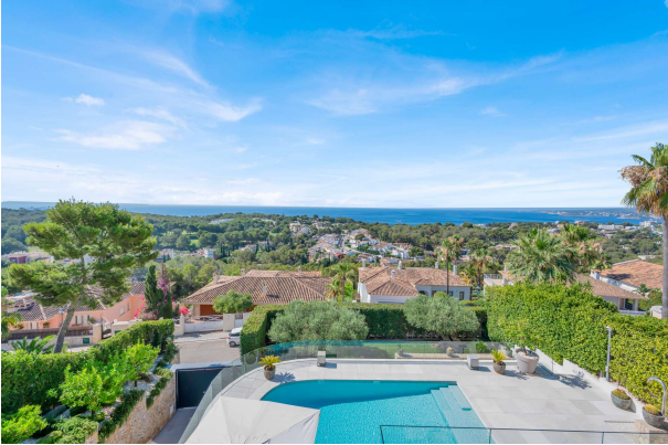
Villa in Bendinat 16