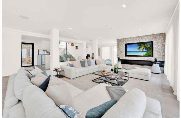
Villa in Bendinat 33