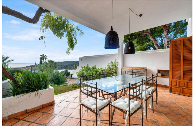
Terrace with sea views in Sol de Mallorca